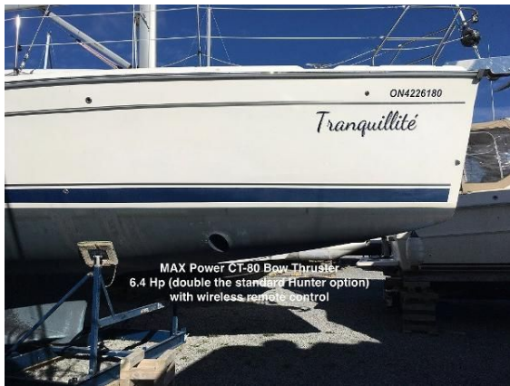
MAX Power CT-80 Bow Thruster 6.4 Hp (double the standard Hunter option) with wireless remote control