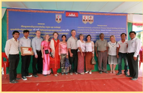
2009 Ta Trav #1