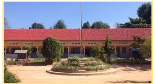
2016 Sret School