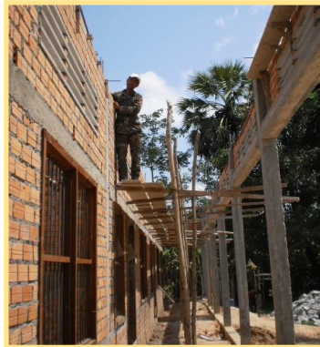
2014 TaTrav Middle School