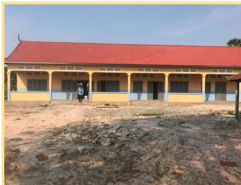
2018 Beng School