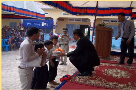
2014 Romoul Kindergarten