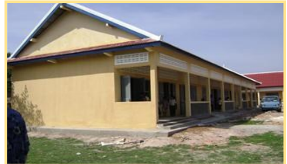
2007 Sras #2 School