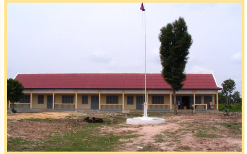
2005 Sras #1