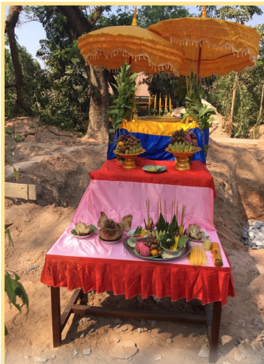
Ground Breaking Ceremony