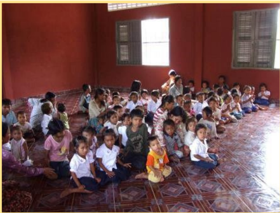
2010 Phlong Kindergarten