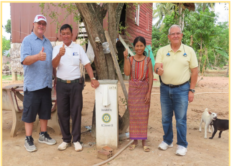
Members of the Rotary Denver Southeast International Service Committee