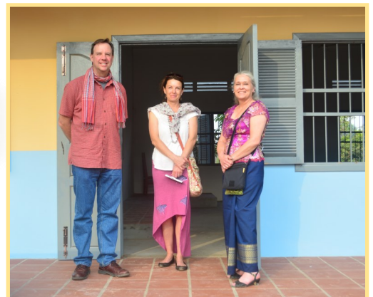
2018 Tapang School