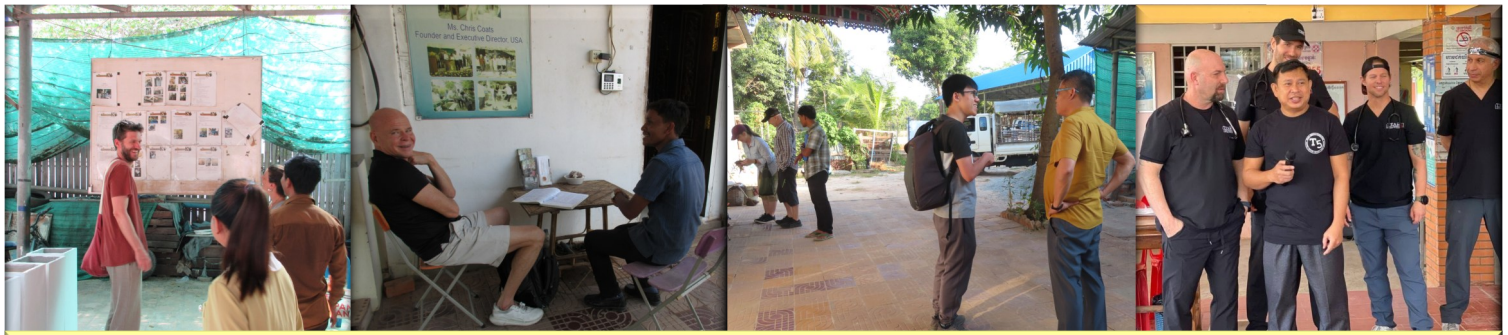
Volunteers and Visitors