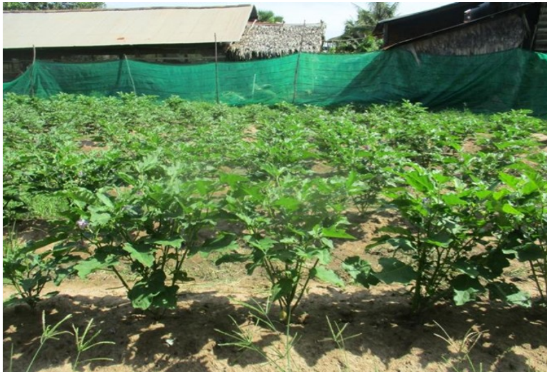
A successfully growing FCG garden

Throughout 2018, Trailblazer staff continued working on a weekly basis with 25 farmers of the Farmer Community Group [FCG] providing technical assistance to grow higher value crops and marketing consultancy. Trailblazer staff also conducted refresher courses on village funds for 24 villages, and introductions on savings group and microfinance processes to 12 new villages.