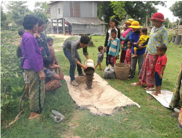
Homestead Garden Training

In 2018, Trailblazer provided agricultural trainings to a total of 887 people (10 to 15 participants for each training course) on horticulture and soil management, composting, organic pesticide and fertilizer, and homestead gardening. At the conclusion of each training, the graduates received some supplies and/or educational materials to help them incorporate their new skills and knowledge into their on-going agricultural pursuits. With each trainee representing an average family size of 5, all totaled, our agricultural trainings directly benefitted 4,435 people.