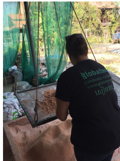
Volunteers at work site.

For more information about volunteering: