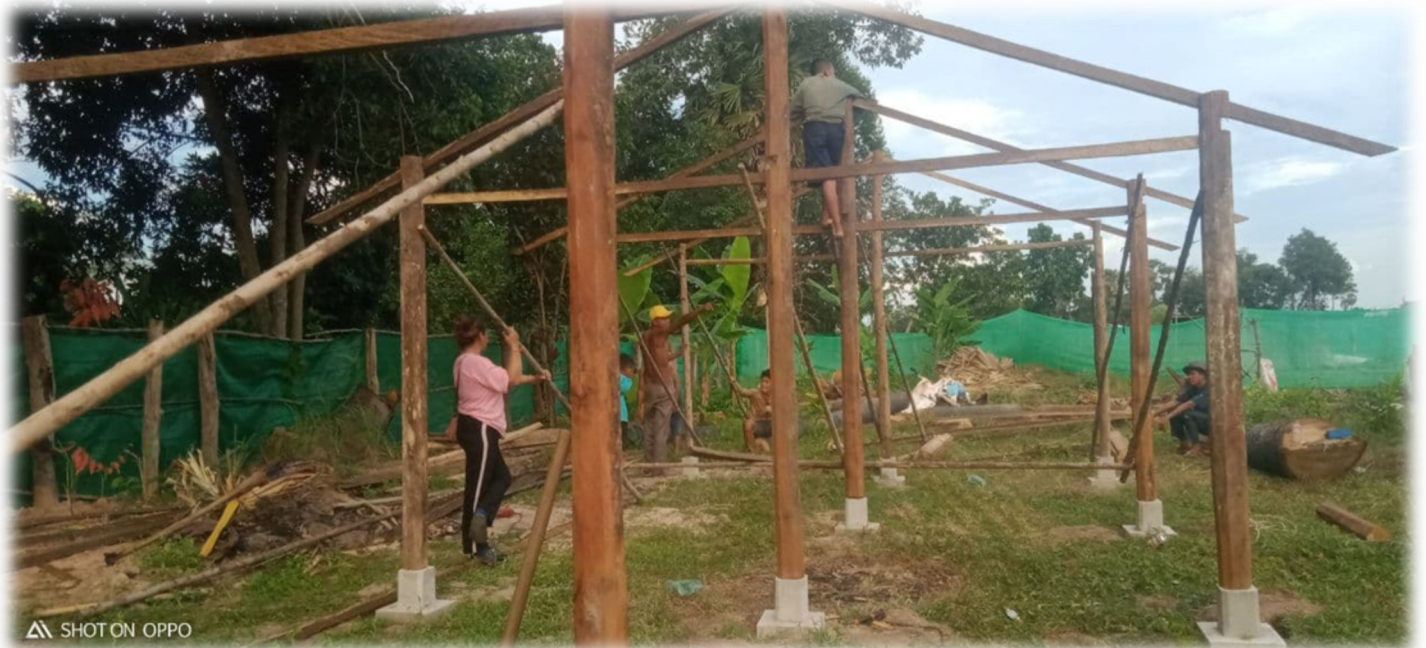
Chicken Farm IV Underway

HELP SUPPORT SUSTAINABLE ECONOMIC DEVELOPMENT