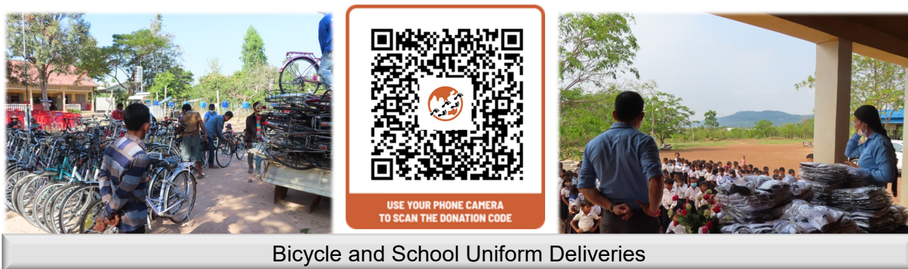
Bicycle and School Uniform Deliveries

Winston Churchill wrote, "We make a living by what we do, but we make a life by what we give."