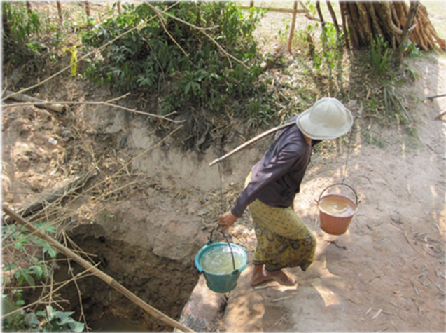
Life without a PVC pull pump well