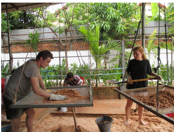
Previous VOLUNTEERS working on bio-sand water filter material

It's been awhile, over two years due to Covid, since we have been able to allow visitors and volunteers to our work site. We are happy to report that visitors and volunteers are once again welcome to participate in our program activities at our Siem Reap work site. In keeping with maintaining health concerns, visitors and volunteers will be required to wear a mask at all times, have their temperature taken daily upon entry, and hand sanitizer is there for their use. If you are interested in helping our teams, please let us know. You can visit our website https://thetrailblazerfoundation.org/volunteers-2 to sign up and find out more information.