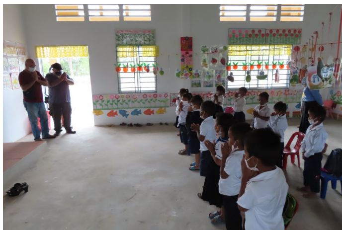
A donor VISITING students whose lives have benefited from his giving.