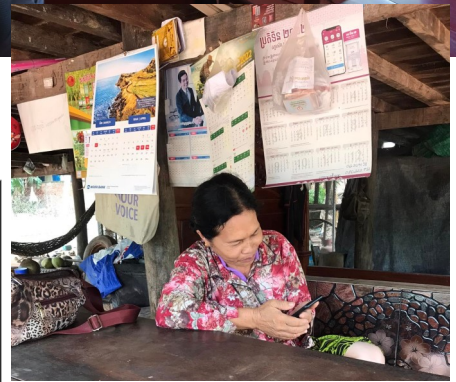
Agriculture Specialist met with village chiefs to prepare trainee list.