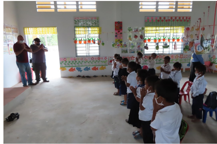
A donor VISITING students whose lives have benefited from his giving.