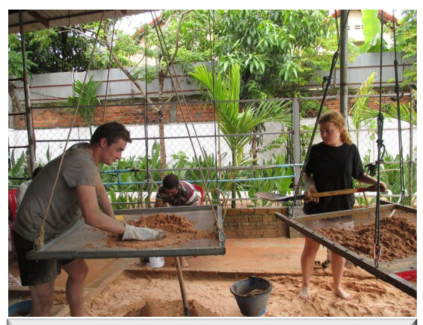
Previous VOLUNTEERS working on bio-sand water filter material