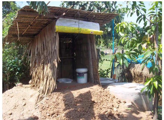
Latrine beneficiary in Meanchey