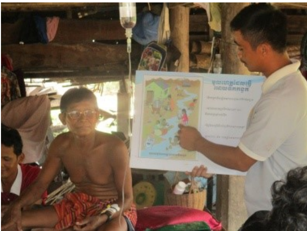
Ta Ey villagers attend training