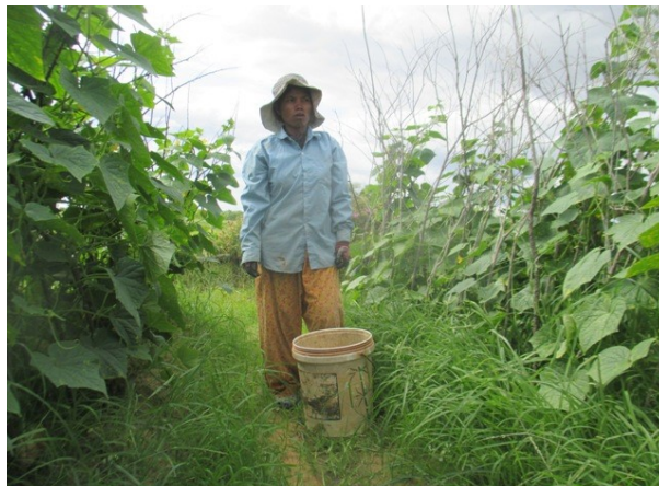
Mean Chey cucumber