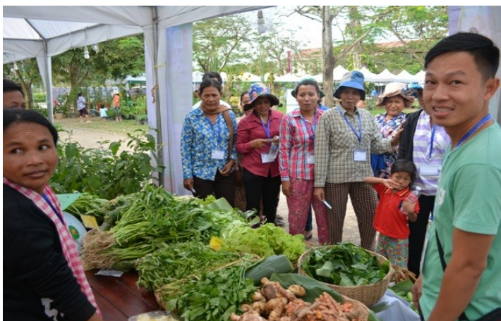
FCG Learning Tour of a Farmer's Market

Due to this success, in 2019 we are considering the establishment of another FCG in another location to be determined through the government's community development integrated workshop process.