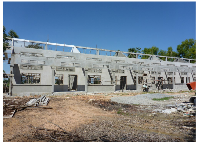
Beng School Construction