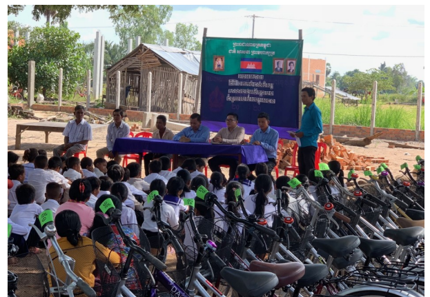
Bike delivery to Beng students

Please visit our website for more information about our Education Program: