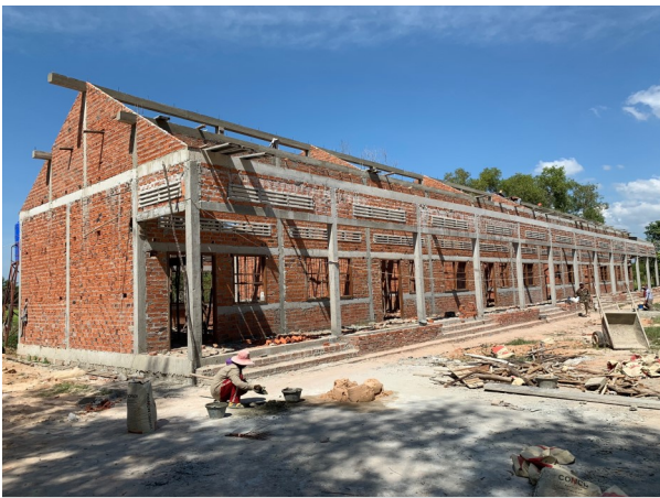
Tapang School Construction

Moreover, children are benefiting from improved learning environments through access to clean water. Access to better sanitation facilities at schools has improved attendance, especially for girls. If the school does not already have toilets, Trailblazer provides toilet facilities in addition to the school construction.