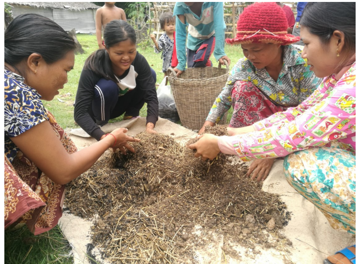
Homestead Garden Training mixing soil in Kbal Krapeu