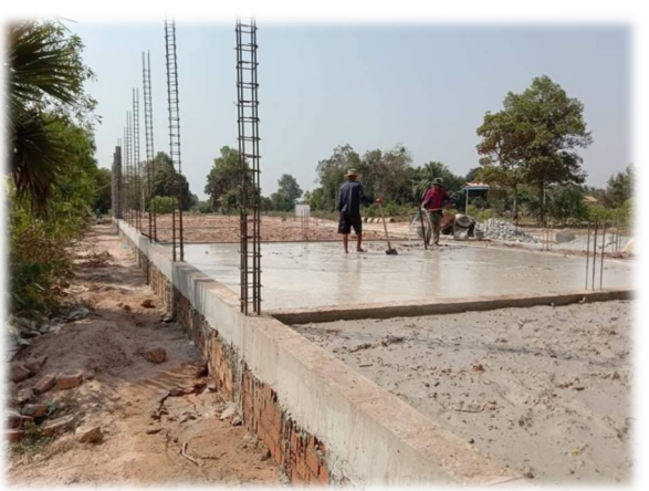
Kok Dong Chas Primary School Construction

Please visit our website for more information about our Education Program: https://thetrailblazerfoundation.org/education-program