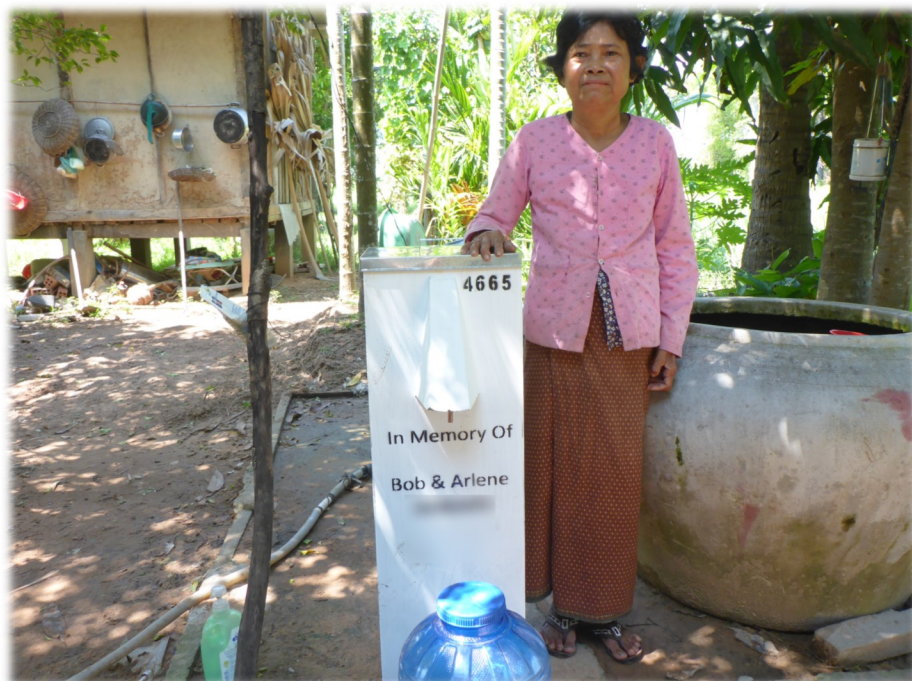
Bio-Sand Water Filter Given In Memory Of