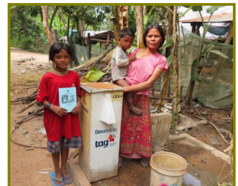
Re-Installed Filter donated by TAG