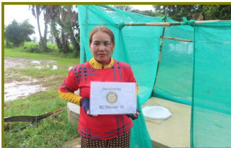
Latrine donated by Rotary Club Denver SE