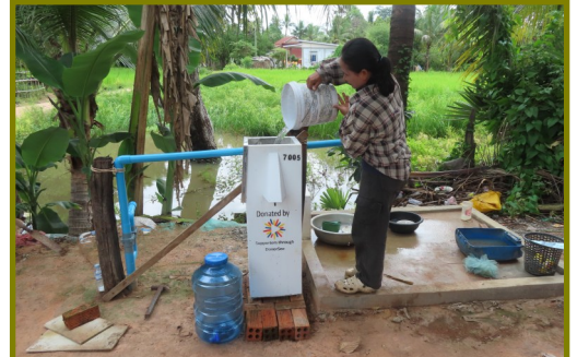
Bio-Sand Water Filter donated by DonorSee Supporters