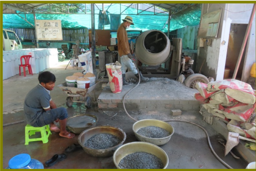
Staff at Work Site