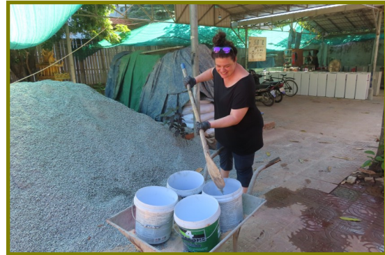
Volunteer at Work Site