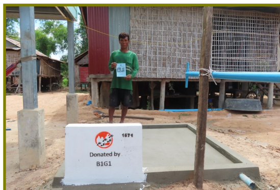
Pull Pump Well donated by B1G1 Supporters