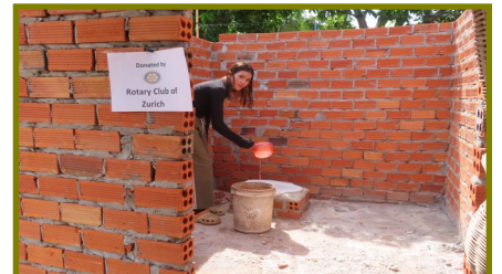
Latrine donated by Rotary Club Zurich