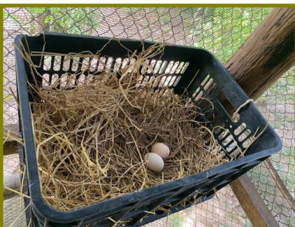
Chicken Farm Re-established Supported by Donor Rhonda