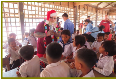
Santa visits Siem Reap Handing Out Toothbrushes