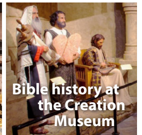
Bible history at the Creation Museum