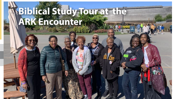
Biblical Study Tour at the ARK Encounter