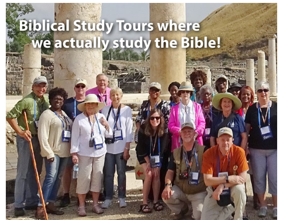
Biblical Study Tours where we actually study the Bible!