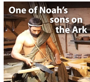
One of Noah's sons on the Ark