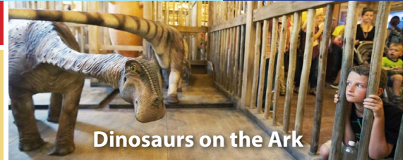
Dinosaurs on the Ark

Day 7: Today, after your Continental breakfast, we head the rest of the way home, a perfect time to chat with your friends and discuss all the great sights you've seen.