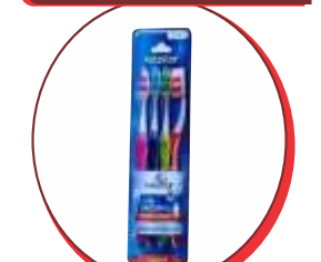
Anti-Bacterial Tooth Brush