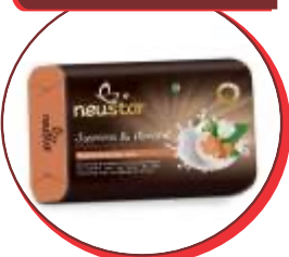
Jasmine & Almond Soap