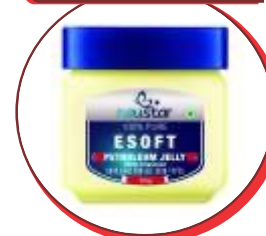
ESOFT Petroleum Jelly