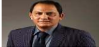
Mr. Mohammad Azharuddin Former Captain, Indian Cricket Team