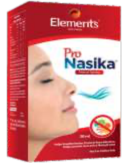
Pack Size : 20 ml

This is a Nasal Spray specially formulated to help protection from infection and aid better breathing. a) prevent virus entry through the nose b) help better breathing by opening up clogged nose c) protection from infection.