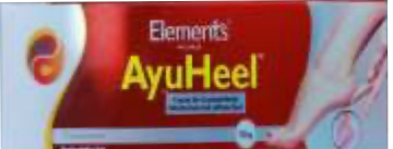
Pack Size : 50 gm

Elements Wellness Ayu Heel is very helpful in repairing cracked heels and also softening the feet through its moisturizing properties. With regular use, you can expect to see a noticeable improvement in cracked heels in a few days.