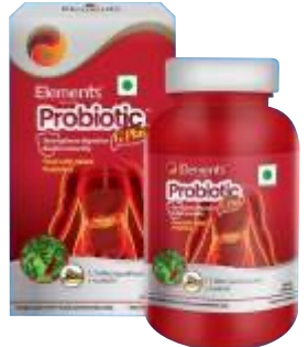
30 N Capsules

Probiotics Help Balance The Friendly Bacteria in Your Digestive System. Probiotics Can Help Prevent and Treat Diarrhea. Probiotic Supplements Improve Some Mental Health Conditions. Probiotics may help keep your heart healthy