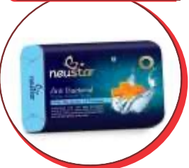
Anti Bacterial Soap