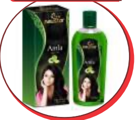
Amla Hair Oil