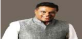
Mr. Ashish Vidyarthi Personal Development & Motivational Speaker

उद्यमिता की एक सफल यात्रा के लिए बुनियादी मार्गदर्शक