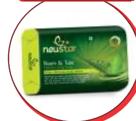
Neem & Tulsi Soap