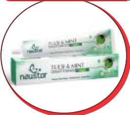
Tulsi & Mint Toothpaste