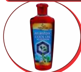
Ayurvedic Cool Oil