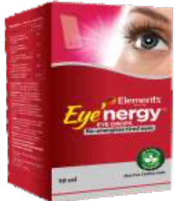
Pack Size : 10 ml