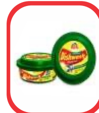
DISHWASH ROUND BAR

It is dosed with a high degree of solvent. One of the problems with ordinary glass cleaners is the presence of streaks after cleaning.