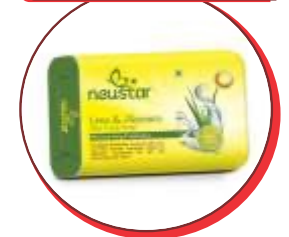
Lime & Aloe Vera Soap