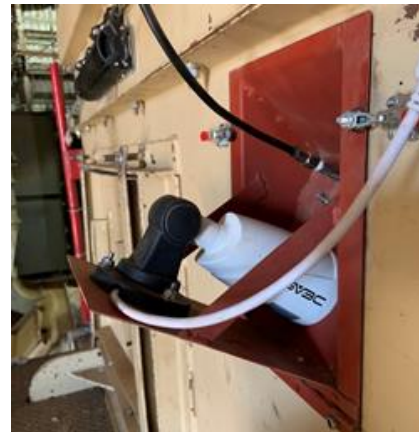
Figure 4. Network camera mounted to the back wall of the module feeder dispersing cabinet at 3 rd Texas gin.