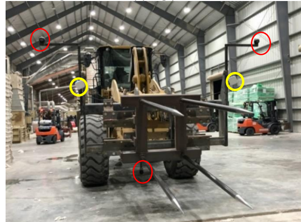
Figure 3. System used at gin yards for two of the Texas gins. Camera locations shown inside red circles and RFID antennas shown inside yellow circles.

to plastic entering the ginning system. In cases when no RFID tag or module identifier tag was available, the dispersing cylinder image timestamp and plastic wrap color was used to review the NVR video log to identify any modules (of that color) that were mishandled during the unloading and unwrapping process.