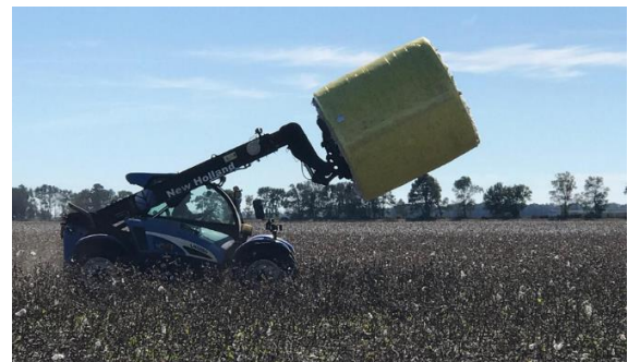
Figure 2. One of the in-field module handlers observed in this study.

During the 2018 and 2019 growing seasons, images were collected from a video camera mounted on two different types of module handlers as they staged modules in North Carolina fields. A similar system was developed