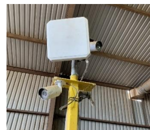
Figure 5. Close-up photo of RFID antenna and NVR cameras on pole mounted to module feeder at 3 rd Texas gin.