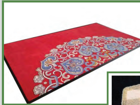
State-of-the-art HD digital printing technology for High Complex prints.