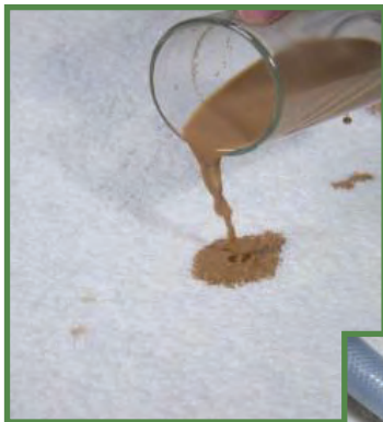
◀ Spilled Coffee, juice, red wine, soy sauce, etc.

*Colors may differ at different angles and distances and may not represent the exact color of the product.