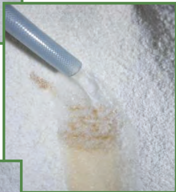
▶ Rinse the dirty area with clean water.