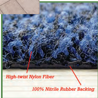
High-twist Nylon Fiber