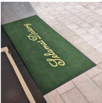
great for tracking dirt and moisture from entrances