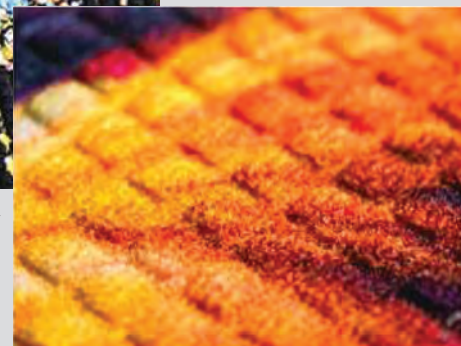
Closeup showing the high definition printing on the waterhog box mat nylon surface. ▶

*Colors may differ at different angles and distances and may not represent the exact color of the product.