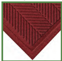
Waterhog Entrance Mat