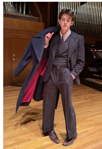
Previous winning garments and pieces as featured in Threads