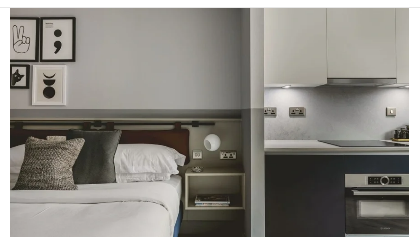
Leven Hotel Manchester

Phase two of Leven Manchester's launch will see a 1,700 sq ft cocktail bar and 4,000 sq ft restaurant space open on the ground and basement levels.