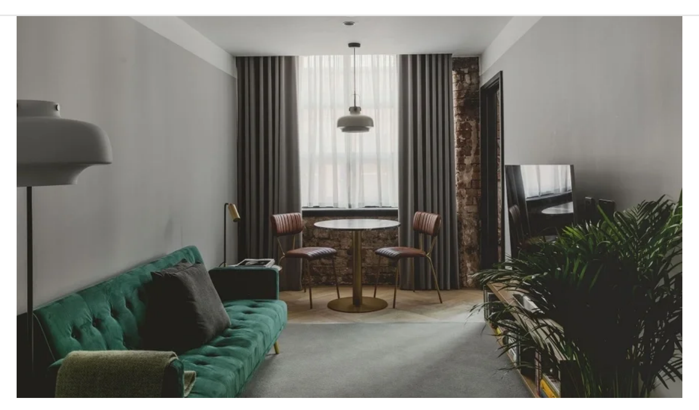
Leven Hotel Manchester

Every room and suite at Leven Manchester will be inspired by the history and industrial bones of the building, merged with sleek interior touches. All will have oak parquet or timber floors, bespoke furniture, Naturalmat mattresses and Grown Alchemist bathroom amenities. Some will have high ceilings, exposed brickwork and standalone bathtubs, while others will have full kitchens.