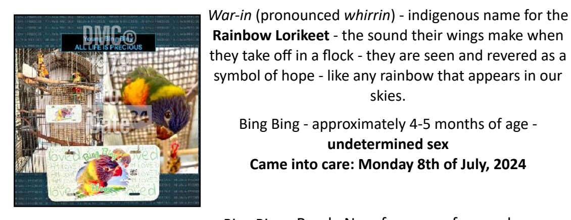
they take off in a flock - they are seen and revered as a symbol of hope - like any rainbow that appears in our skies.