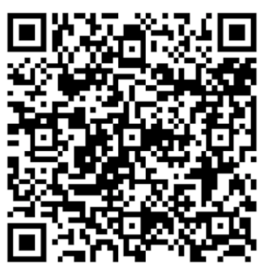
Scan to Learn more about Bing Bing here.

The Rainbow Lorikeet's tongue is like a bristle brush. Unlike many other parrots, they DO NOT eat seeds or commercial seed products - they are nectar - pollen eaters.