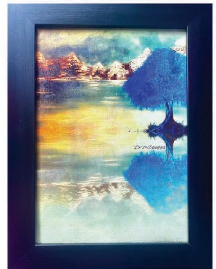
The Jacaranda Blues - Acrylic on flat panel canvas - DMC©1998