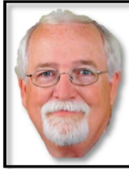
Flags Editor & NCM Ambassador