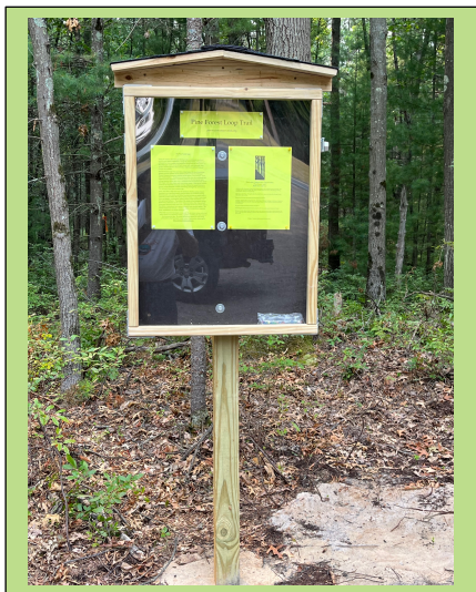
Pine Forest Loop Trail marker. Parking and public access off Business 31, across from the Pines Motel