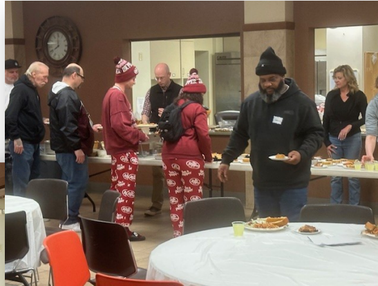
Crossroads Connections Sunday