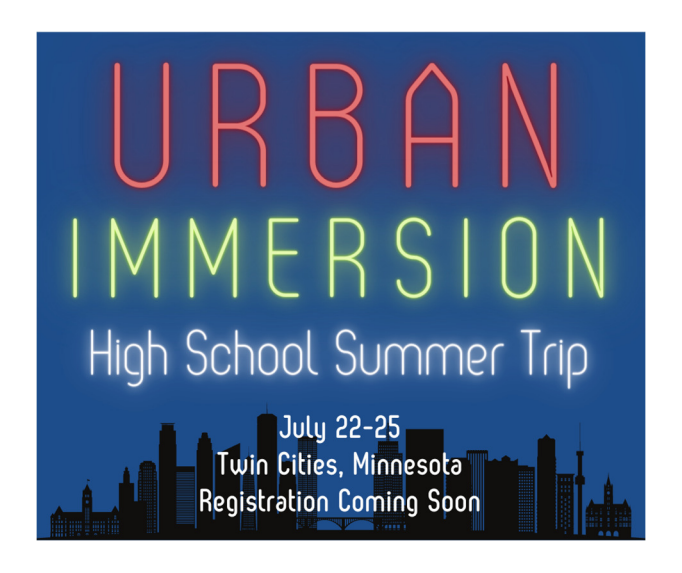
Friday, July 22 - Monday, July 25

$100 per youth (plus $$$ for 2 fast food lunches and spending).