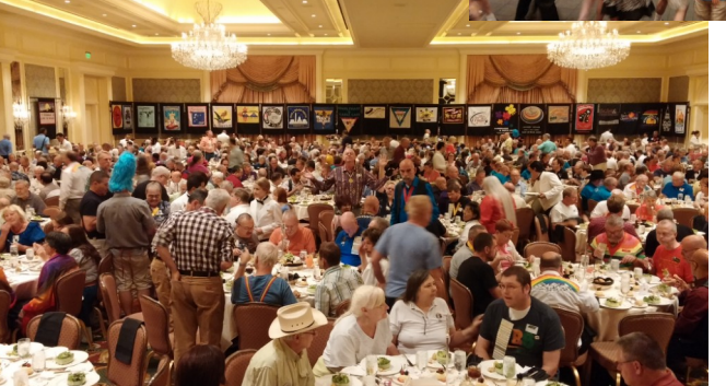
Banquet—Squeeze the Hive