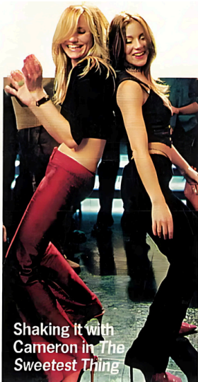
Shaking it with Cameron in The Sweetest Thing