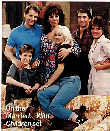
On the Married... With Children set