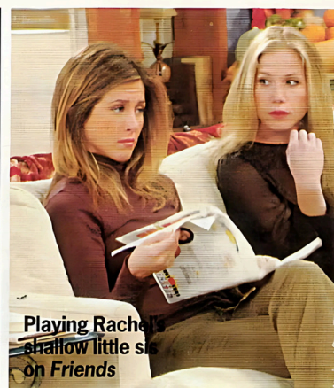
Playing Rachel on Friends

when he's newly clean-shaven, that gets me. I'll stop whatever I'm doing. There's just something about his freshly shaved face and the smell of aftershave or cologne that drives me insane. Absolutely. I can't handle it. It drives me wild.