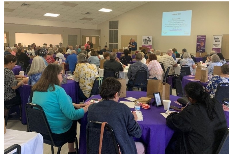
The annual June conference in Alvin in 2023 attracted 201 attendees.

In addition to the library screenings during National Alzheimer's Disease Awareness Month (November), we also provide screenings at our caregiver conferences and community health fairs.