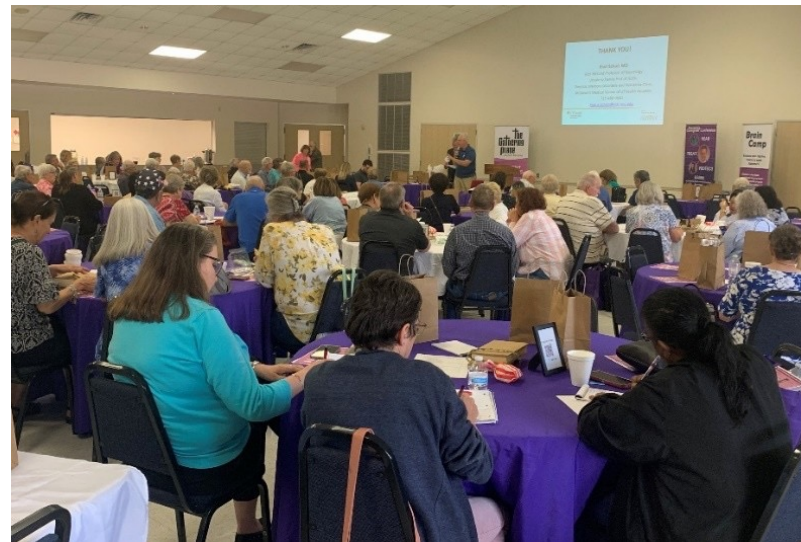
The annual June conference in Alvin in 2023 attracted 201 attendees.

In addition to the library screenings during National Alzheimer's Disease Awareness Month (November), we also provide screenings at our caregiver conferences, community health fairs and "Memory Matters" events held at senior living facilities in September and October.