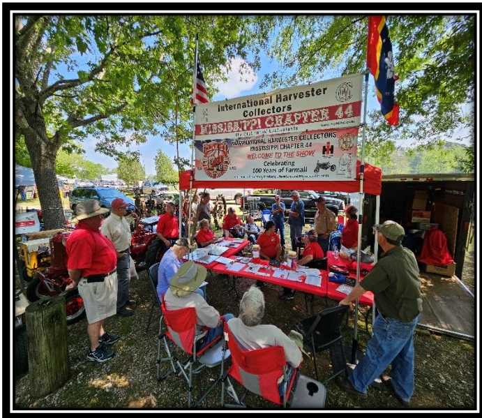
Spring 2024 MS IHC 44 State Show Chapter Meeting; Houston, MS The largest Mississippi Valley Flywheelers show attendance in the past 20 years.

We're excited to share some highlights from our Chapter 44 Spring State Show held in Houston, MS. Attached, you'll find a collection of photos capturing the spirit and excitement of the event. Enjoy the snapshots from a wonderful two days!