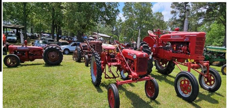
More good-looking tractors from the Spring 2024 MS IHC 44 State show/Mississippi Valley Flywheelers show in Houston, MS.