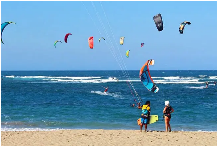
Kite Beach Cabarete, DO 57000

Kite Beach is one of the best coastlines in the world for kitesurfing.