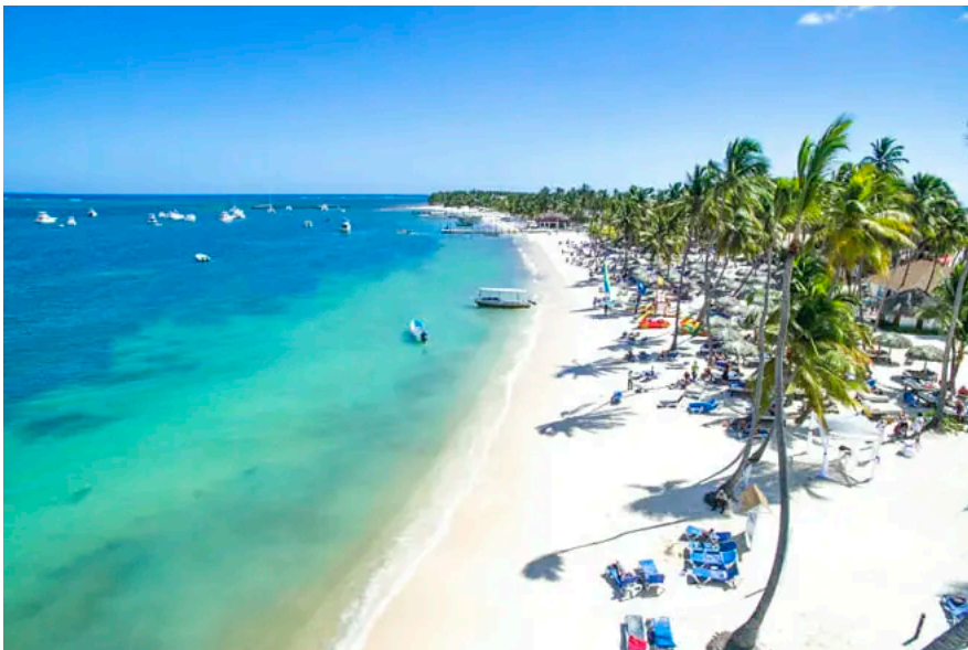
Playa Bavaro Punta Cana, DO 23000

Bavaro Beach is one of the most popular beaches in the Dominican Republic.