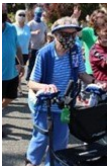
Madonna is trucking!

Wonderful news! PASD just announced the following: