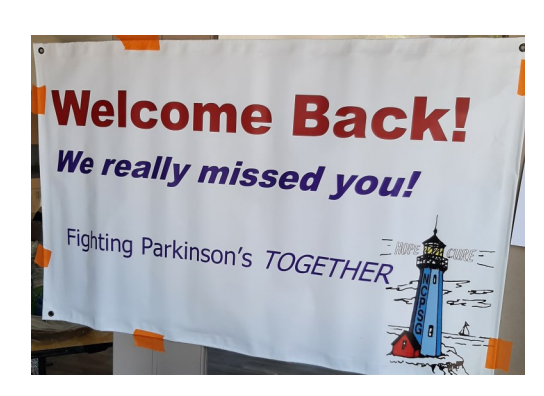
Inside This Issue