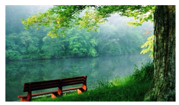
He is able to do far more abundantly than all we ask or think.

Please make sure the church office has your birthday. We would like to wish you a Happy Birthday.