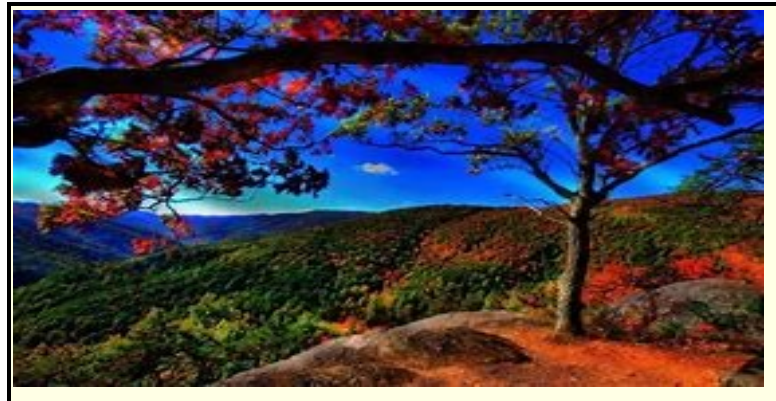
Every generous act of giving, with every perfect gift, is from above, coming down from the Father of lights, with whom there is no variation or shadow due to change.