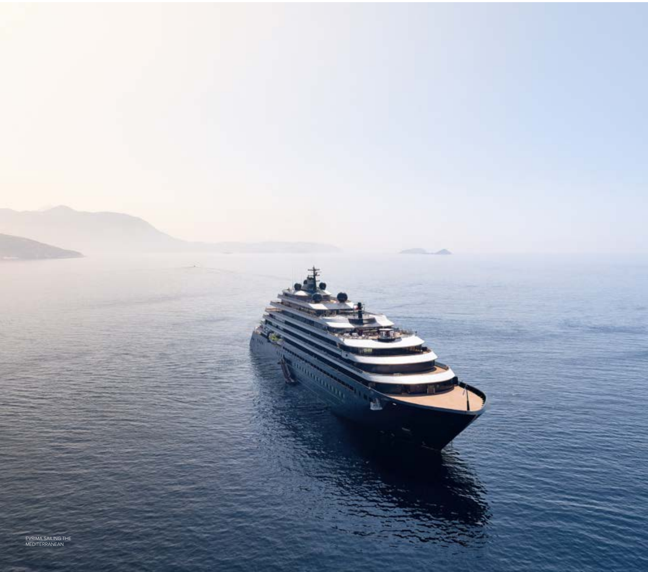
EVIRMA SAILING THE MEDITERRANEAN