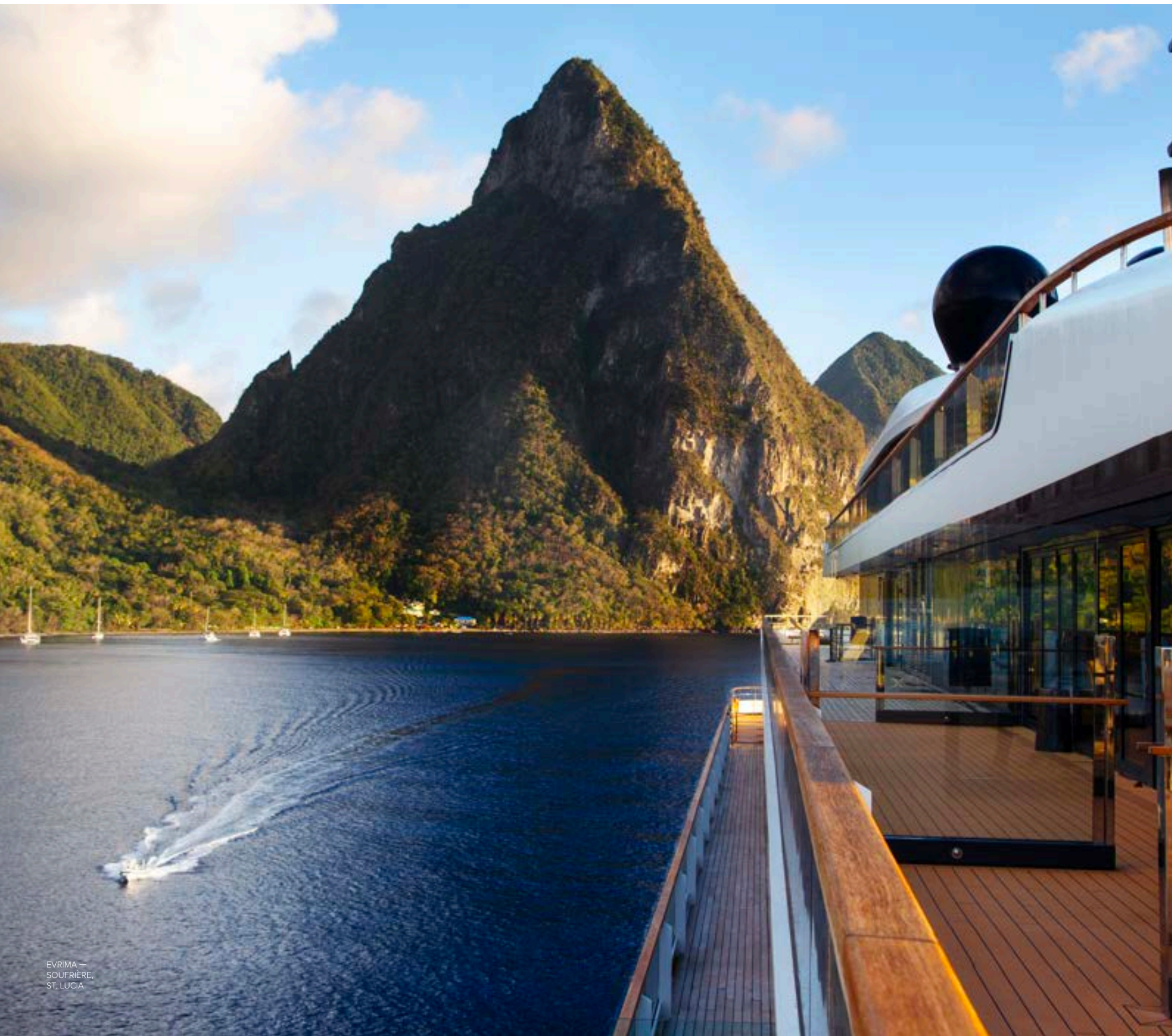
EVRIKA — SOUFRIÈRE, ST. LUCIA