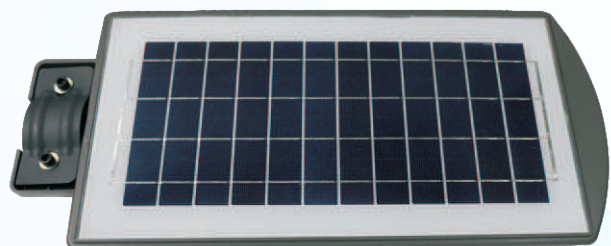
Polysilicon solar panel