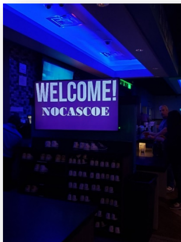
NoCASCOE Bowling Tournament