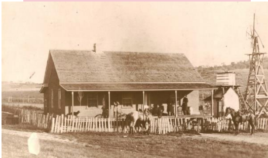
Part of California's ranching heritage since 1880

The purpose of this non-profit organization shall be to protect and enhance the ecological values of the Chimineas Unit of the Carrizo Plains Ecological Reserve and to help provide opportunities for wildlife dependent recreation, education, and research activities which are compatible with conserving the biological integrity on the reserve.