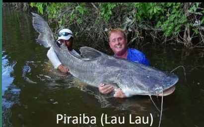
Piraiba (Lau Lau)