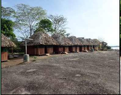
Camp two, based on the banks of the River Tuparro provides large tented accommodation, both single and sharing. There are the usual amenities, WC, Shower and fans for comfort along with a fully functioning camp kitchen.

The main camp is located on the banks of the River Orinoco and is about 4hrs from Puerto Carreño. This is a purpose-built camp comprising bespoke one & two person cabins each with WC, shower and portable A/C. There is a main 'lodge' providing an extensive 'chill out' area as well as the camp kitchen. This is the main focal point for all meals and social gatherings. The camp also has the luxury of WiFi.