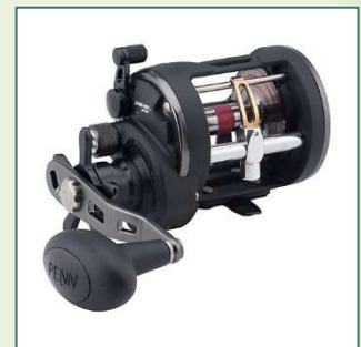
PENN 'Warfare' 20LW

For 'fixed spool' reels, go for 12000 (minimum) series bait-runners. Select one with a strong clutch and a smooth drag. You will need to ensure it can accommodate a line capacity of at least 250yds of 100lb braided mainline. Make sure the mainline is fully secured on the spool. For those preferring multiplier reels, again ensure the same line capacity and clutch / drag performance as the fixed spool reels. Type of reel is an individual choice, and both work well.