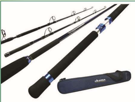
OKUMA 'Nomad' 20-60lb 7' 0"