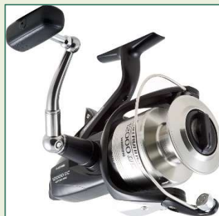
SHIMANO 'Oceanic' 12000BC