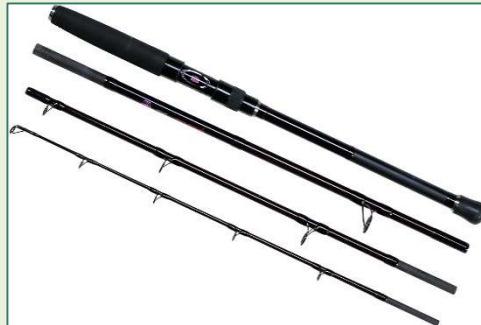
PENN 'Rampage' 30-50lb 7' 4"