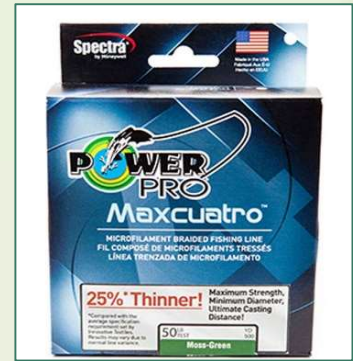
Power Pro Max Cuatro (25% Thinner)

Most anglers will have their personal preference based on past use / experience, but the above are a few braided mainlines that we have used successfully over the years. In general, 'moss green' formats work well, although we have seen yellow, red, and other colours which have attracted Piranha!! For this environment, braid needs to be tested at 100lb minimum. Make sure that when loading your spool, there is either a 'mono' backing, or the braid is otherwise secured to the spool, we have seen free running spool packs in the past which is a serious problem and is difficult to fix easily whilst out on the boat.