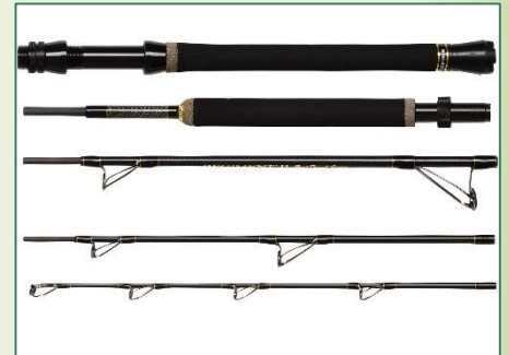
PENN 'Regiment' 30-50lb 7' 4"

Short 'heavy action' boat rods no longer than 7' 10" (2.4m) are ideal and are easy to manage on the boats. Whilst longer rods allow for increased cast distance, 'close to boat' fish management can be difficult. We have used several types of rod rated at 20lb – 60lb and have adequately managed fish way in excess of 250lb. We have seen clients with similar rods in a 1pc configuration, although multi-section i.e. 3pc or 4pc rods are far easier to handle on both international and local flights.