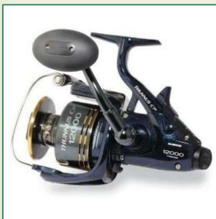
SHIMANO 'Thunnus' 12000

Short 'heavy action' boat rods no longer than 7' 10" (2.4m) are ideal and are easy to manage on the boats. Whilst longer rods allow for increased cast distance, 'close to boat' fish management can be difficult. We have used several types of rod rated at 20lb – 60lb and have adequately managed fish way in excess of 250lb. We have seen clients with similar rods in a 1pc configuration, although multi-section i.e. 3pc or 4pc rods are far easier to handle on both international and local flights.