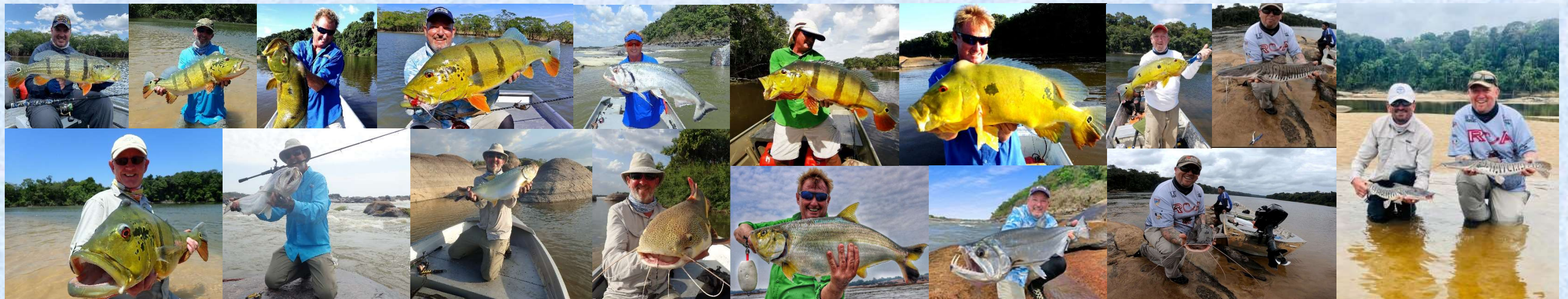
Rio Orinoco & Rio Tuparro, Colombia, Feb/ Mar 2020