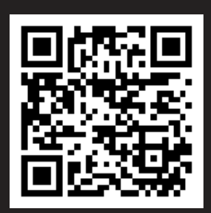
SCAN HERE or visit www.drivewellmichigan.com