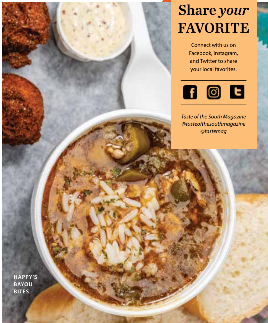
HAPPY'S BAYOU BITES