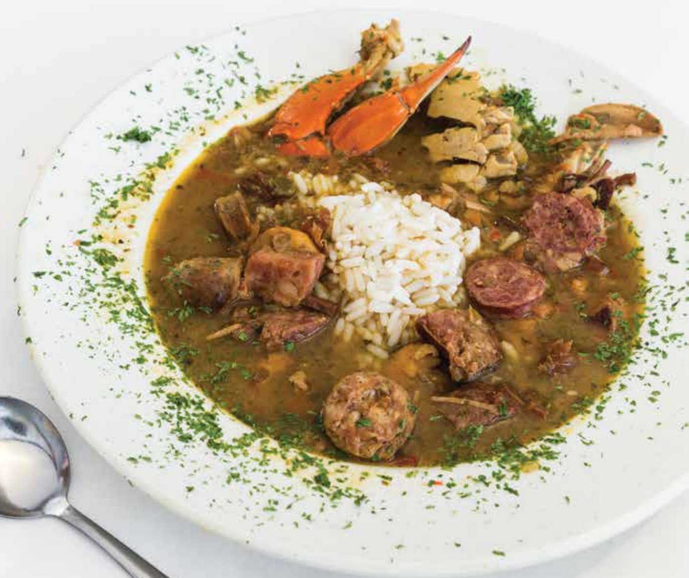
LI'L DIZZY'S CAFE

AS SEEN IN - TASTE OF THE SOUTH