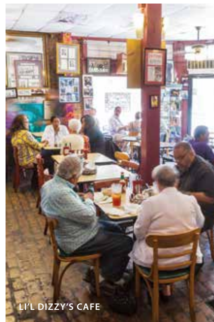
LI'L DIZZY'S CAFE

Taste of the South Magazine @tasteofthesouthmagazine @tastemag