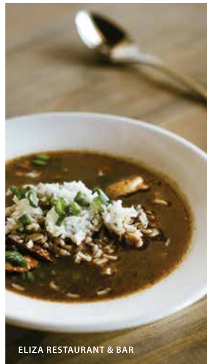
ELIZA RESTAURANT & BAR

Taking things over to the Magnolia State, Steve's Marina Restaurant in Long Beach, Mississippi, dishes out completely from-scratch seafood gumbo nightly. You can even order it by the gallon to dish out for family and friends at home without any of the hassle. Then, there's The Ole Biloxi Fillin' Station in Biloxi, Mississippi. It's the perfect stop for a delicious side of gumbo paired with your choice of po'boy or any of their other mouthwatering entrées. Fisher's at Orange Beach Marina brings us to the Intracoastal Waterway in Orange Beach, Alabama, with their Gulf Shrimp & Okra Gumbo, studded with locally sourced catches. Then, it's on to Florida where the welcoming crew at Happy's Bayou Bites treats you like family while offering up scratch-made chicken-and-sausage gumbo from the comfort of their unassuming roadside shack in Dunedin. We wrap up our list with our friends in Galveston, Texas. Little Daddy's Gumbo Bar cooks up a selection of savory gumbos (and other Cajun fare) in specially designed steam kettles while Black Pearl Oyster Bar & Grille sticks to the basics with their rich pork-and-seafood gumbo. All are worthy options and master classes in Southern fare, but there are certain to be several we missed. What about your favorites? We want to see where you get your gumbo fix. Show us on social media by tagging #TasteoftheSouth. 📌