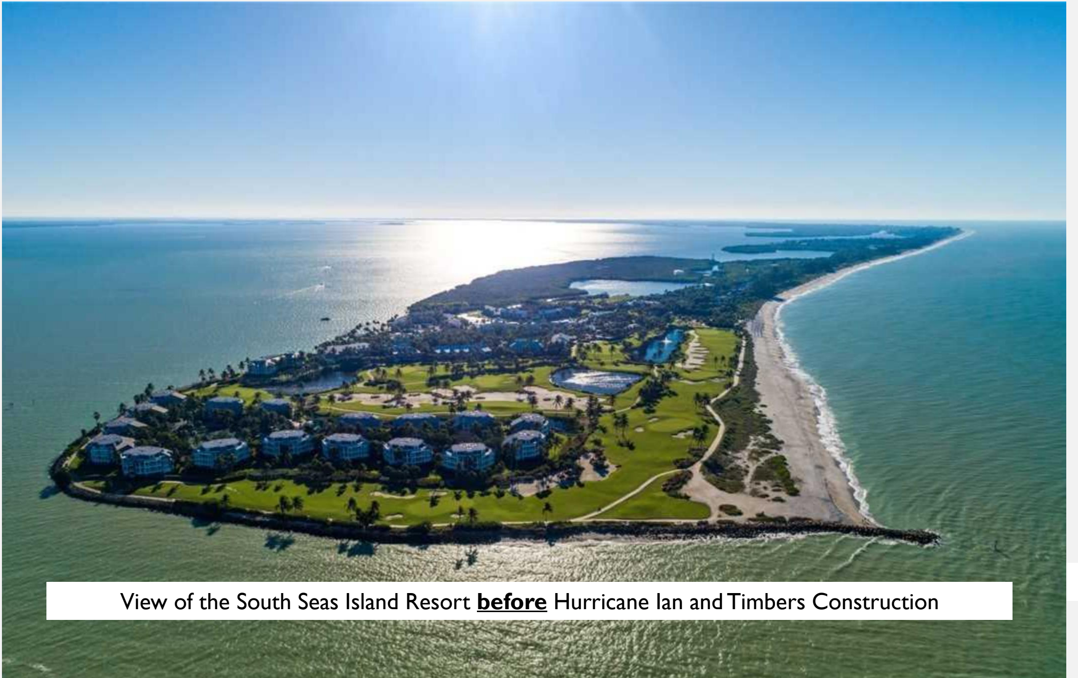
View of the South Seas Island Resort before Hurricane Ian and Timbers Construction