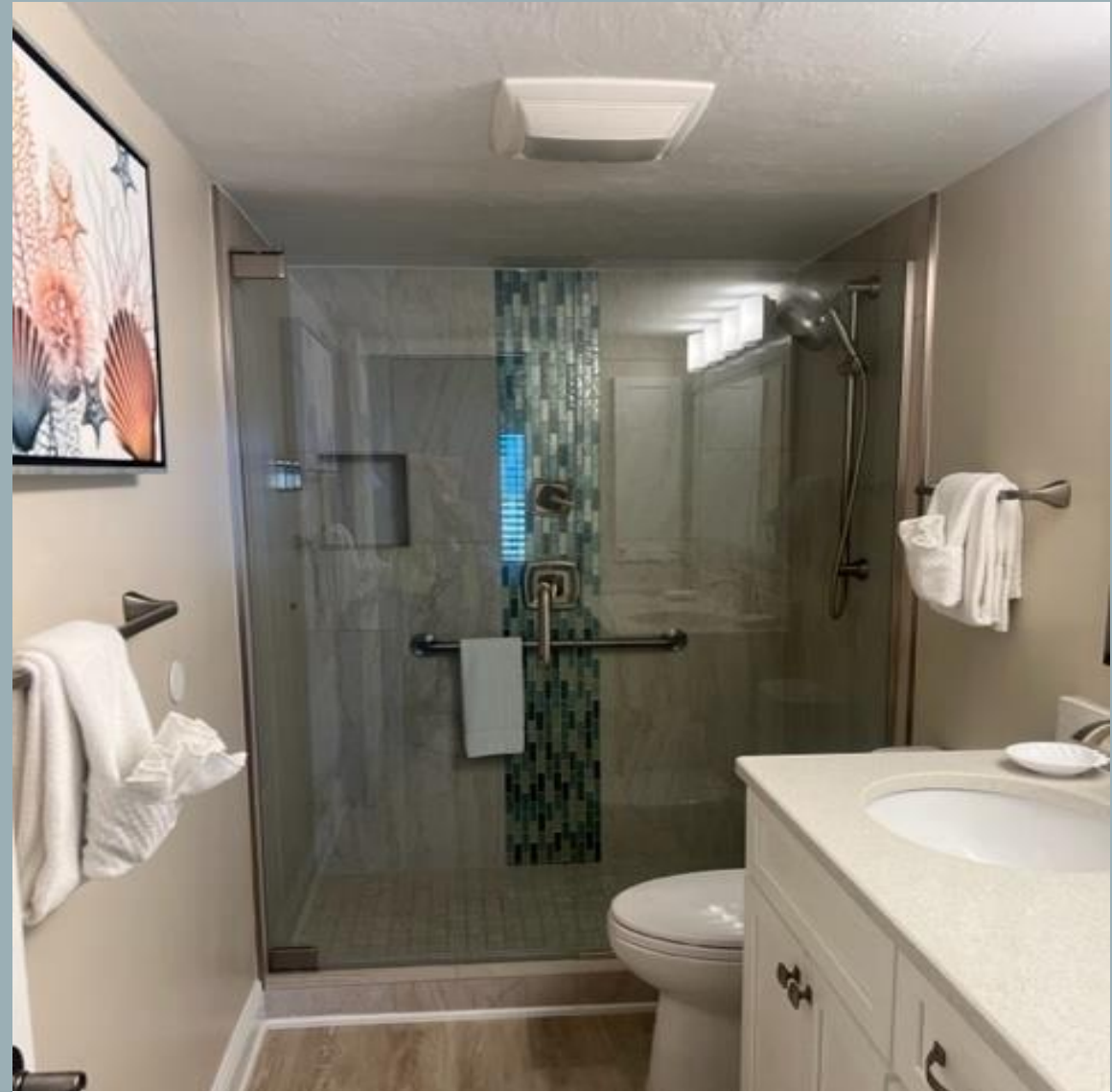
Master Bathrooms have been repaired and inspected. New Shampoo, Conditioner and Body Wash dispensers are installed in the Shower to reduce small individual bottle waste.