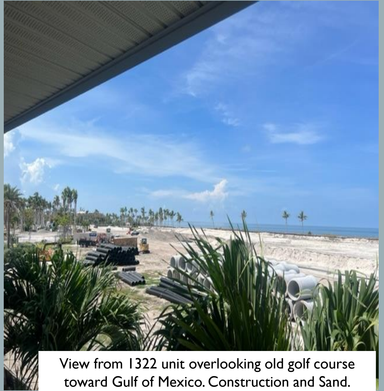
View from 1322 unit overlooking old golf course toward Gulf of Mexico. Construction and Sand.