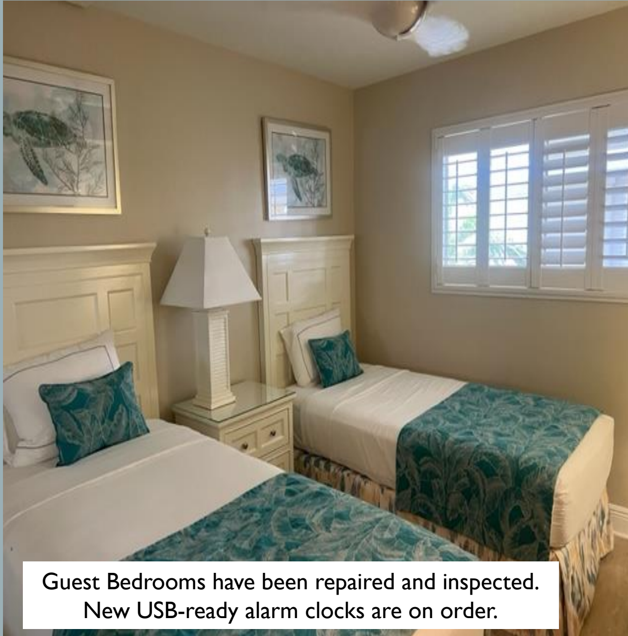
Guest Bedrooms have been repaired and inspected. New USB-ready alarm clocks are on order.