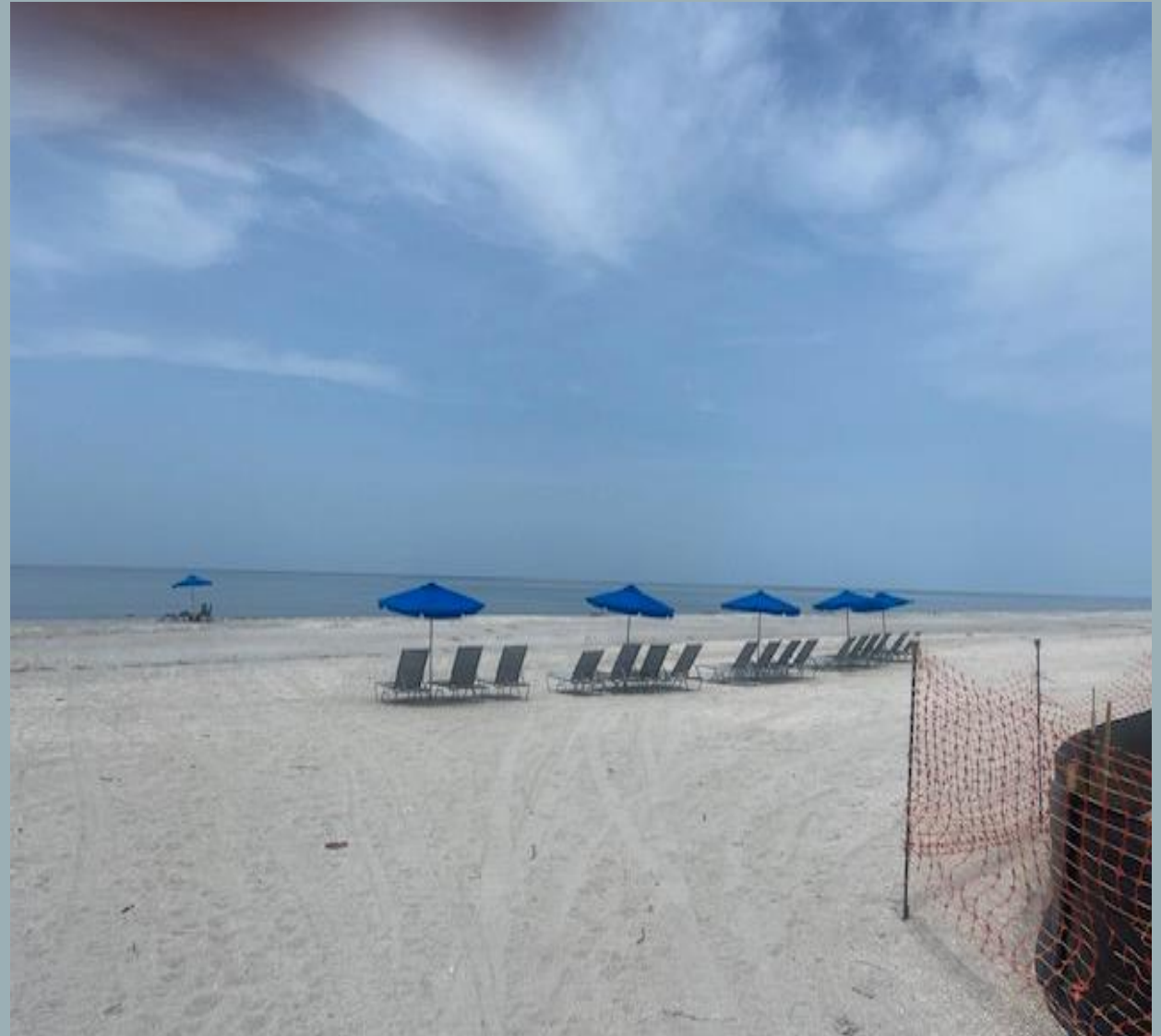
View of Beach. No Drinks or Food options on Beach. Chairs & Umbrellas are not available for South Seas Club usage. Other options for rentals to be offered.