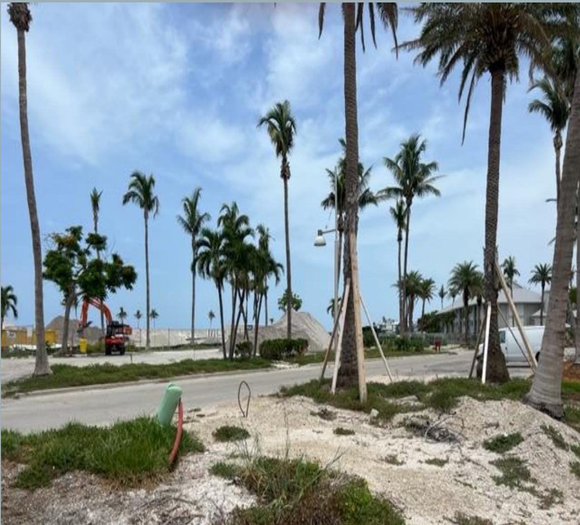
View of old Golf Course & Pro Shop across Plantation Road and South Seas Club to the right with photographers back toward Harbor. Large sand piles and equipment & fencing is visible.