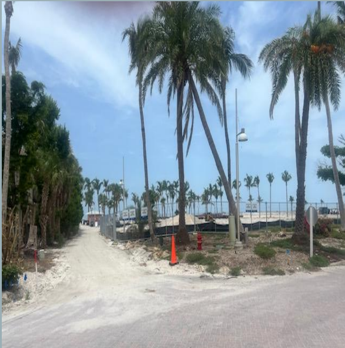
View of Sunset Beach access pathway from Plantation Road to Beach. Fencing and construction is visible. Beach Bathrooms are not functioning.