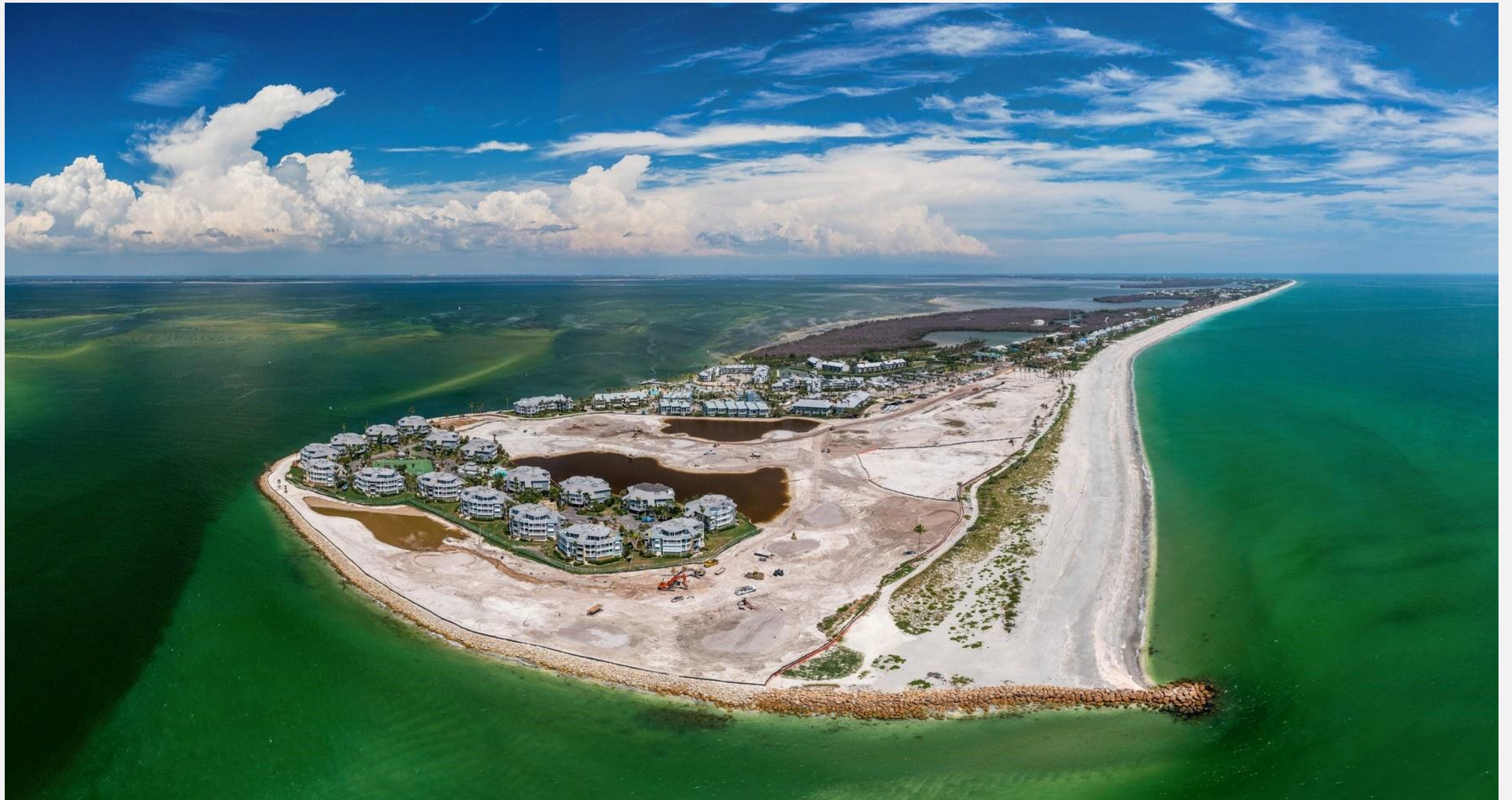
View of the South Seas Island Resort after Hurricane Ian and with current Timbers Construction