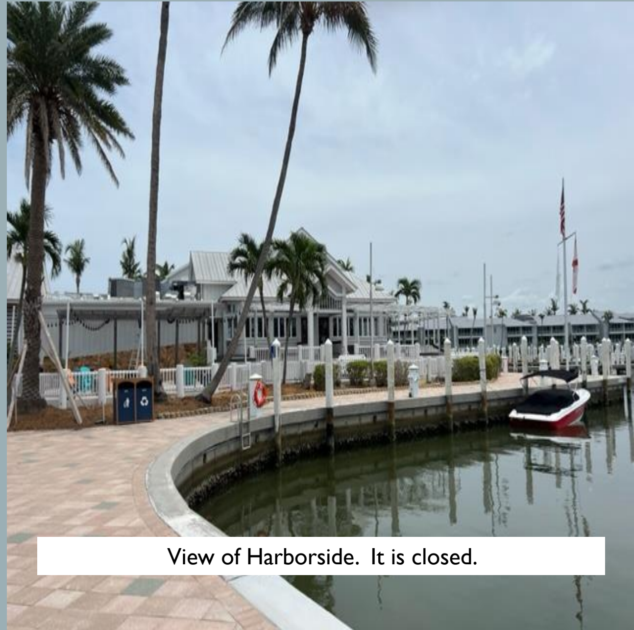
View of Harborside. It is closed.