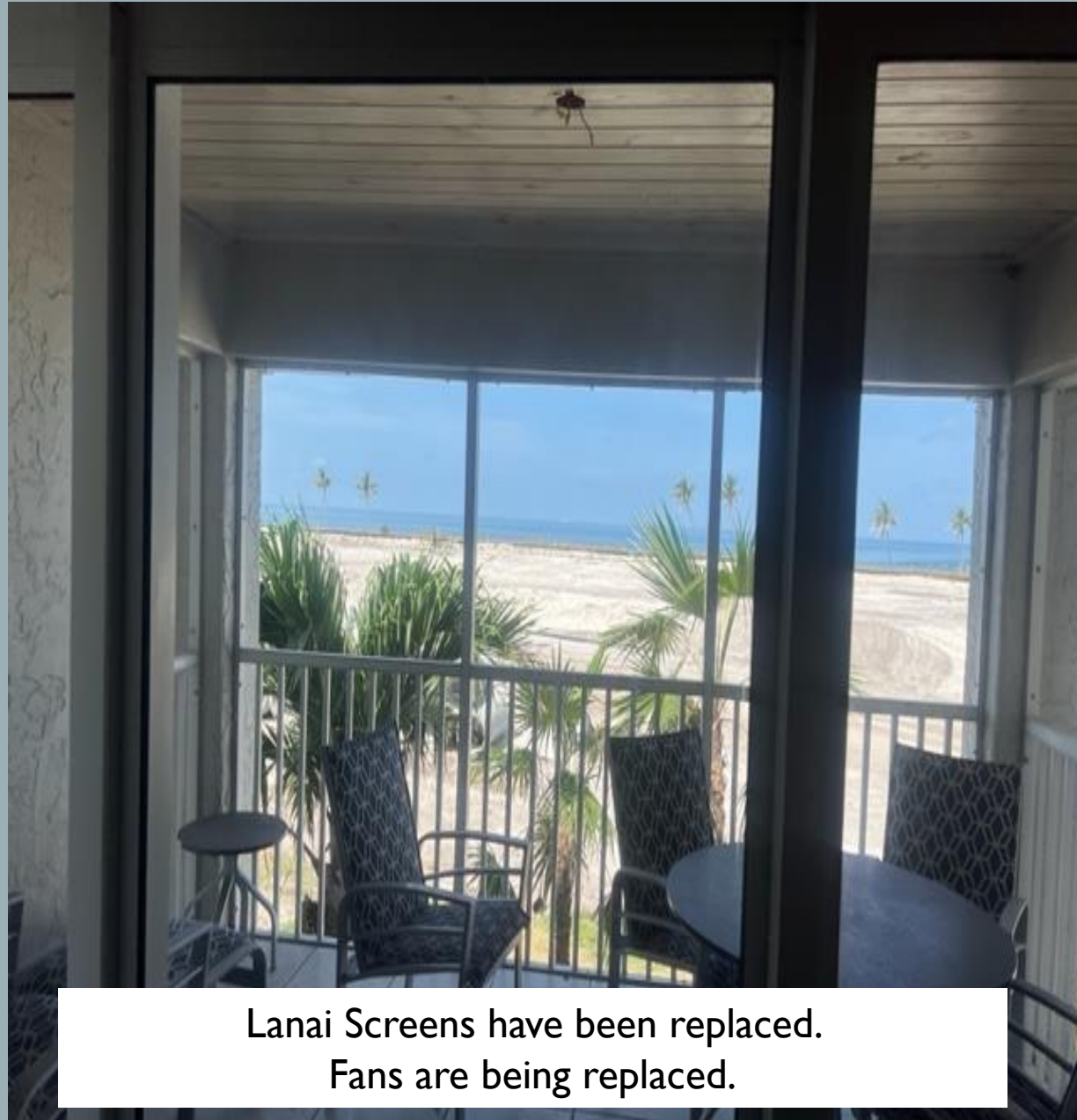
Lanai Screens have been replaced. Fans are being replaced.