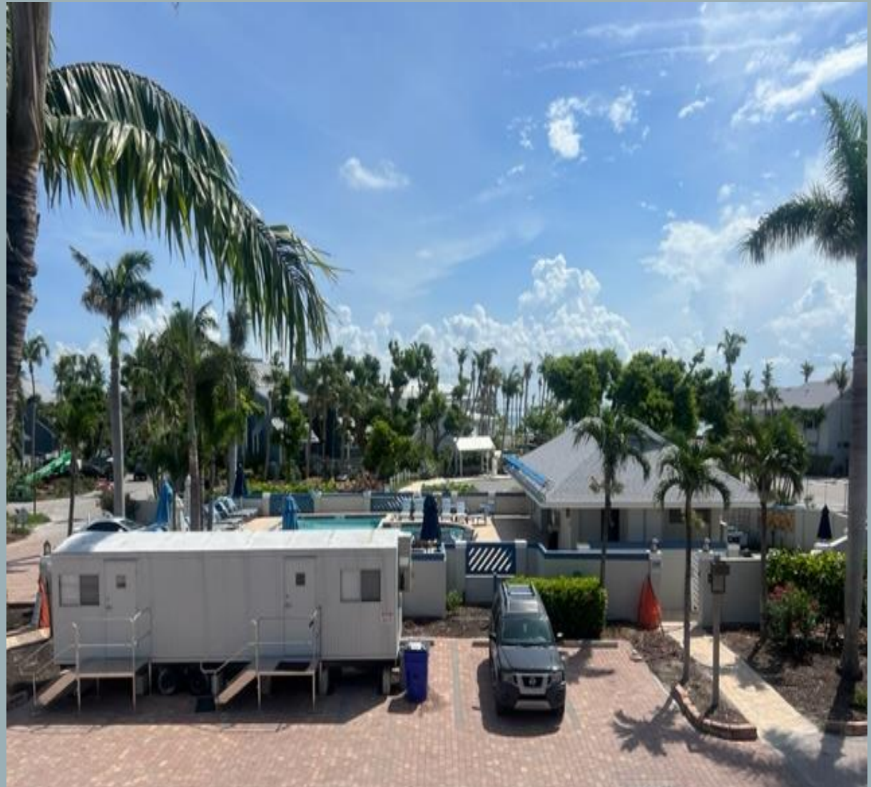
Pool and Cabana area functional; Gate is not installed; Temporary Fencing blocking main entry; ATI Contractor Trailer in SSC Parking Lot until units are completed