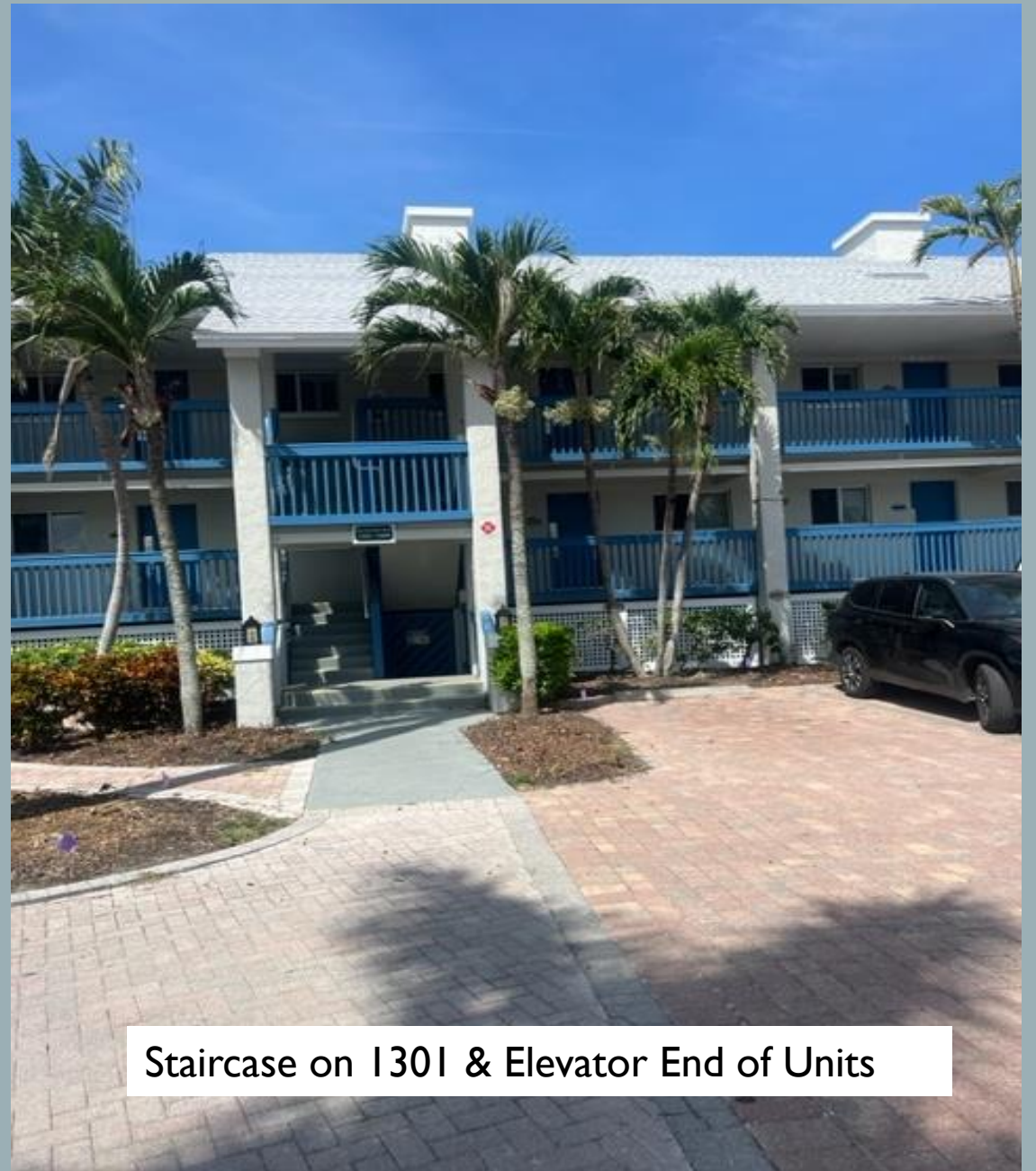
Staircase on 1301 & Elevator End of Units