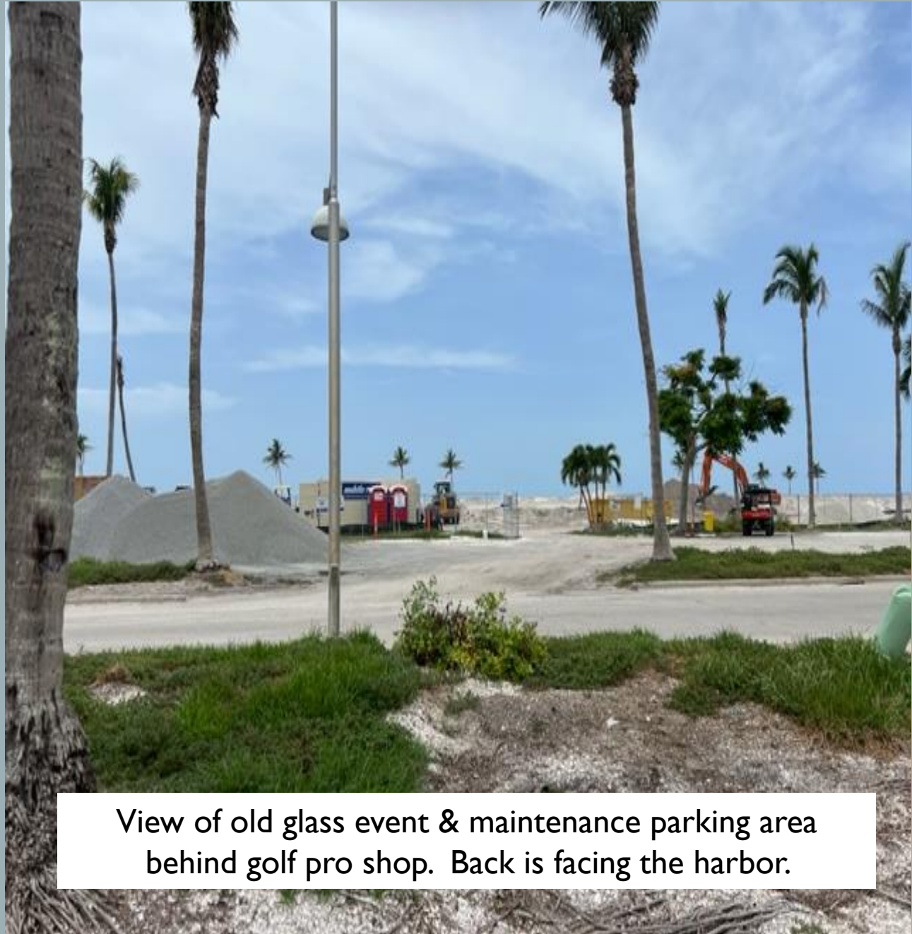
View of old glass event & maintenance parking area behind golf pro shop. Back is facing the harbor.