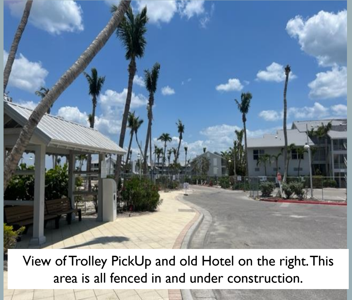
View of Trolley PickUp and old Hotel on the right. This area is all fenced in and under construction.