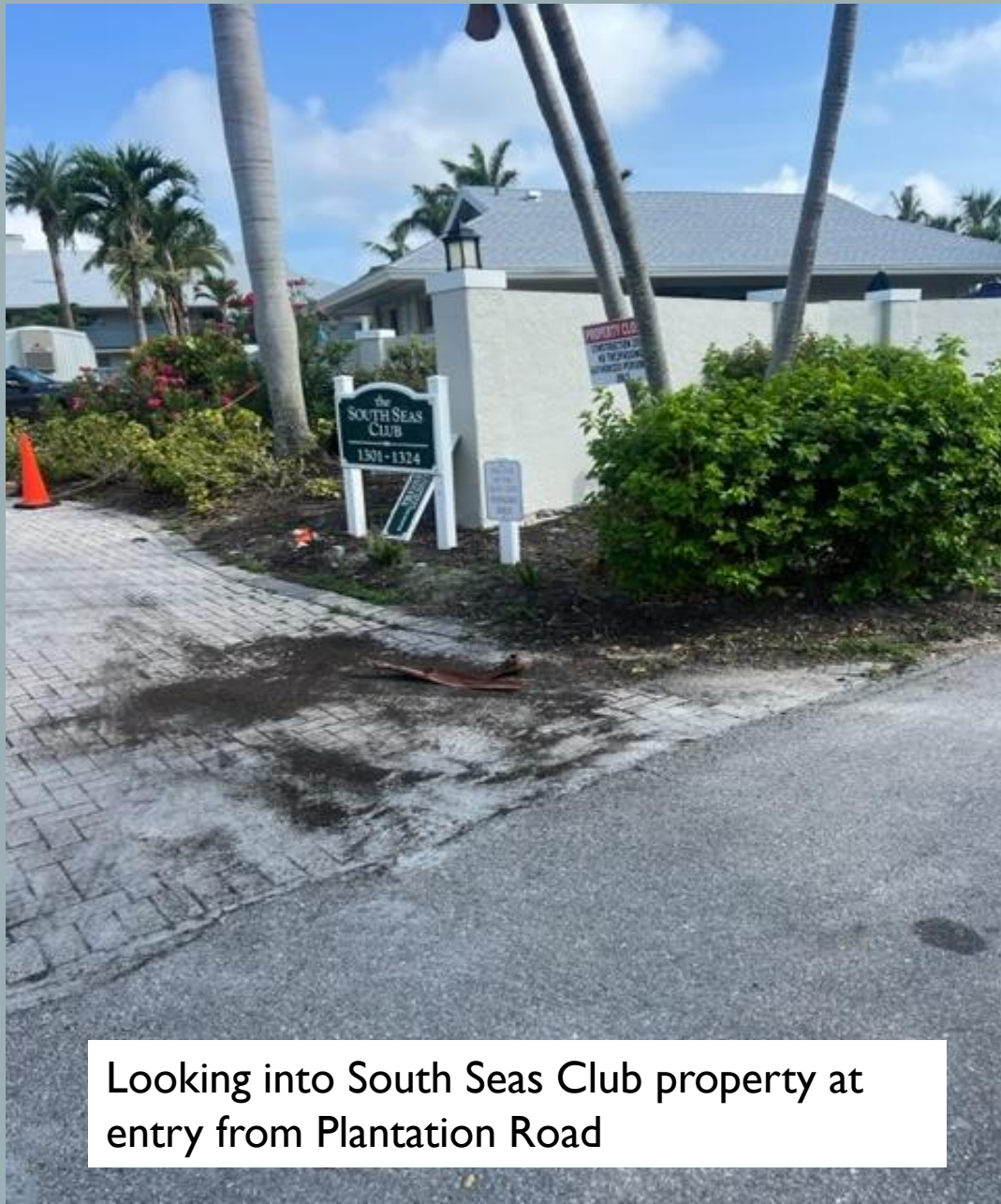
Looking into South Seas Club property at entry from Plantation Road