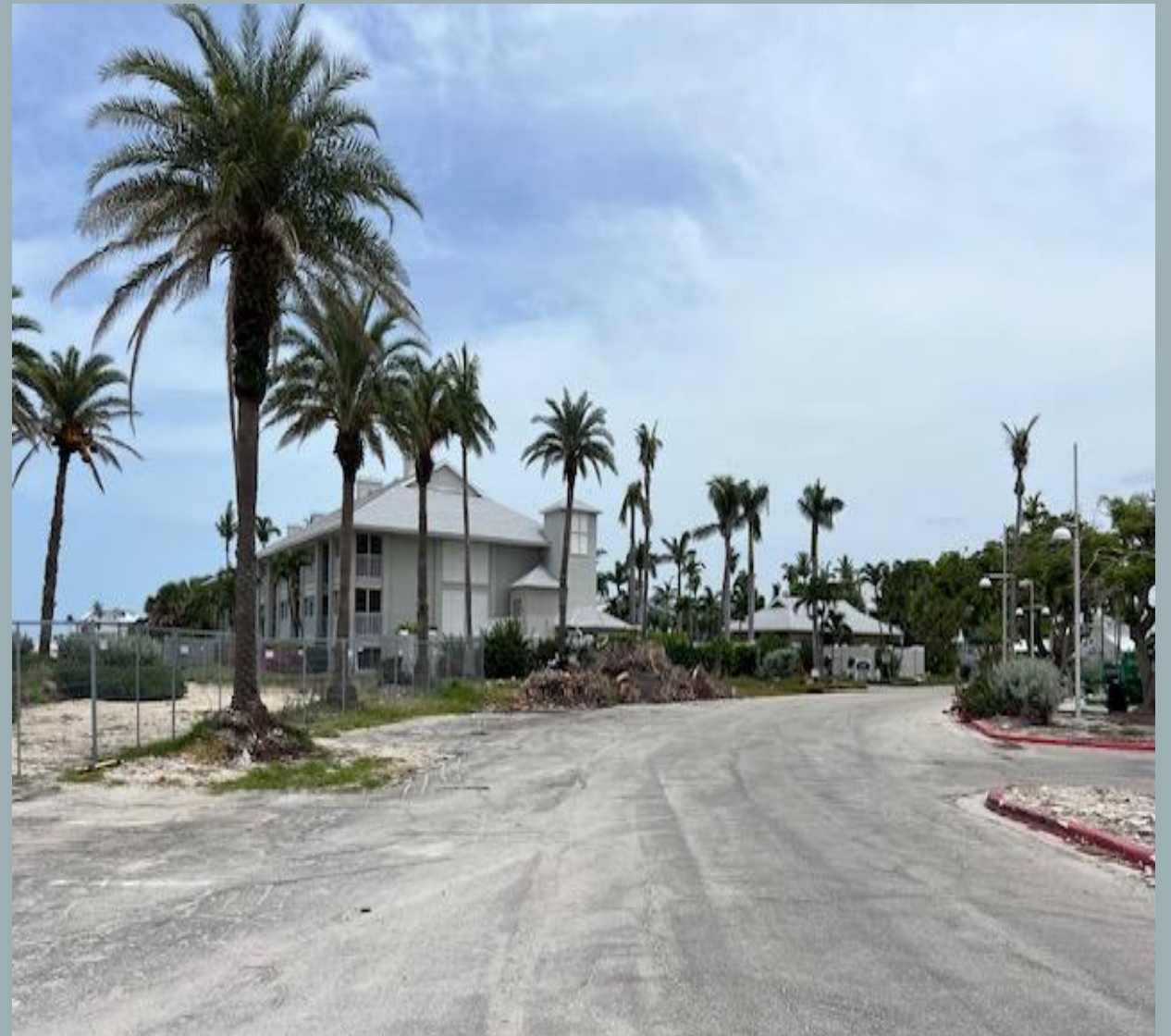
View driving down Plantation Road toward South Seas Club with fencing and large pile of landscaping debris on left side.