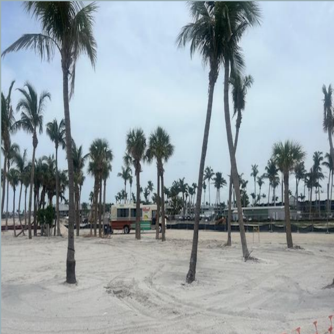
View of Taco Food Truck roaming the island. One of Two options to purchase food & drink using credit card.