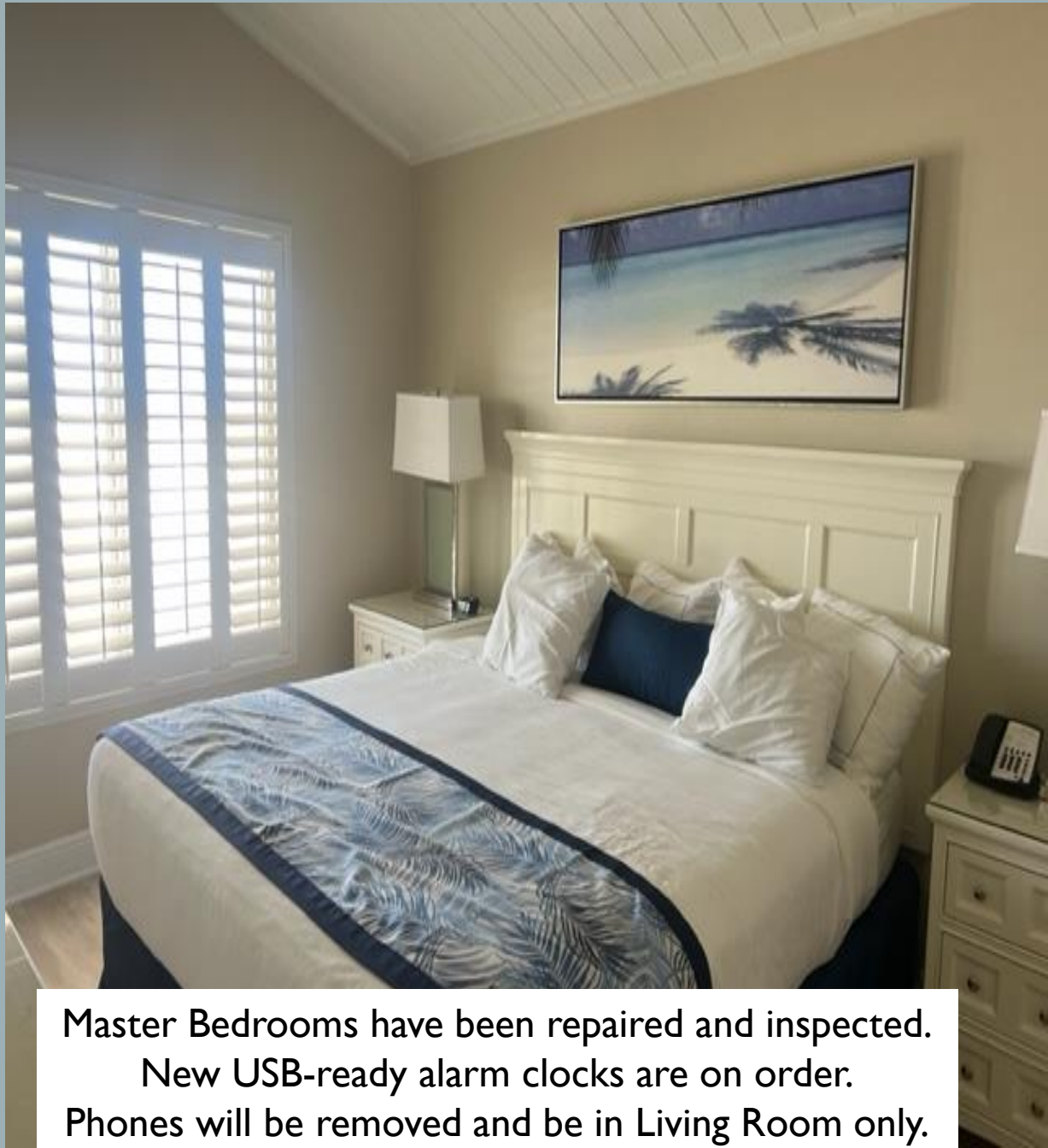
Master Bedrooms have been repaired and inspected. New USB-ready alarm clocks are on order. Phones will be removed and be in Living Room only.