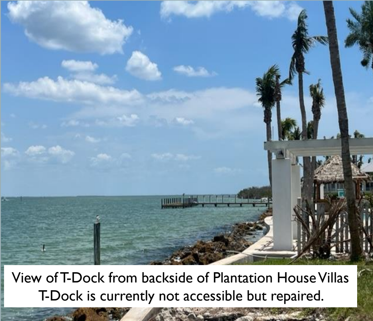
View of T-Dock from backside of Plantation House Villas T-Dock is currently not accessible but repaired.