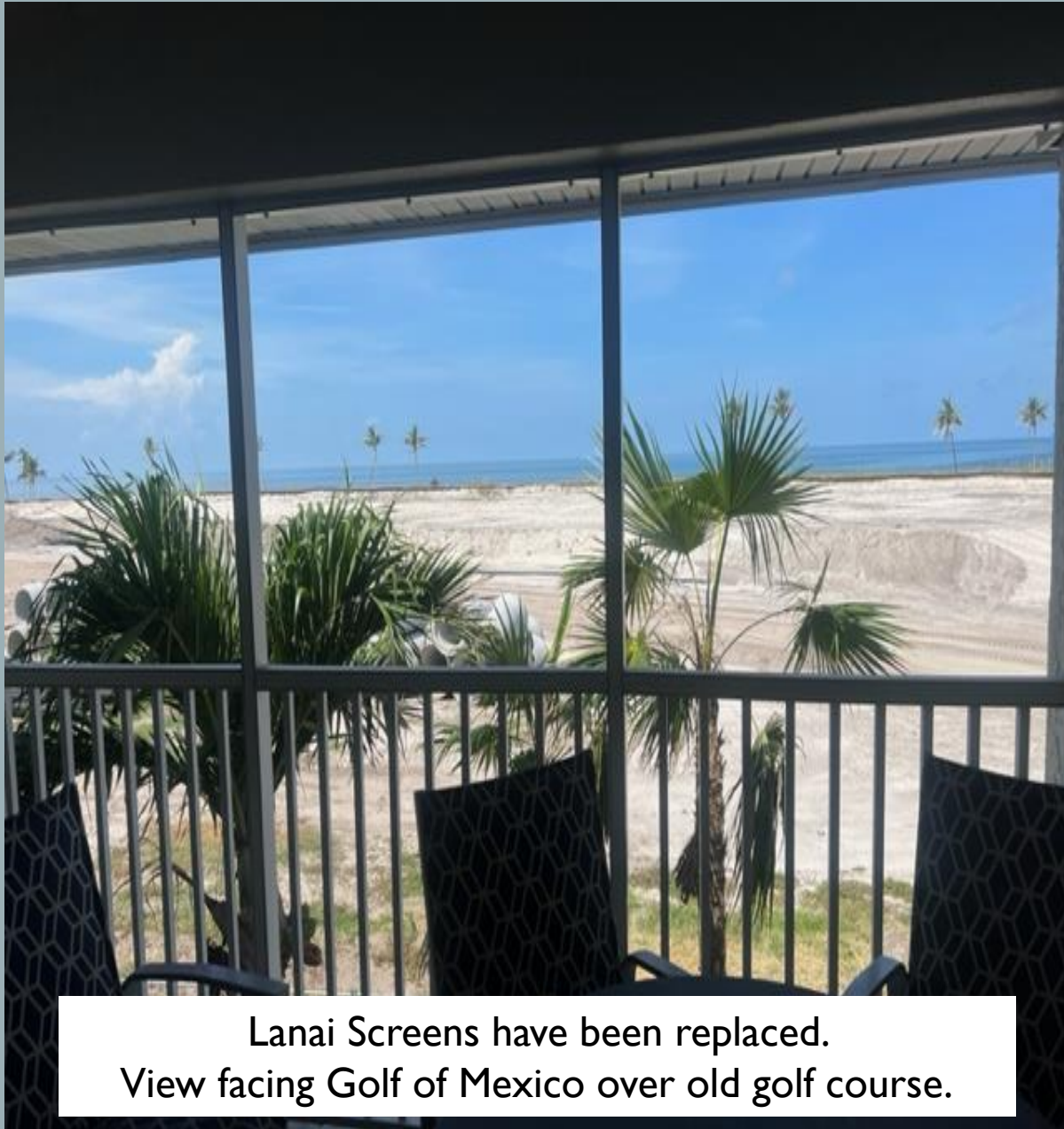
Lanai Screens have been replaced. View facing Golf of Mexico over old golf course.