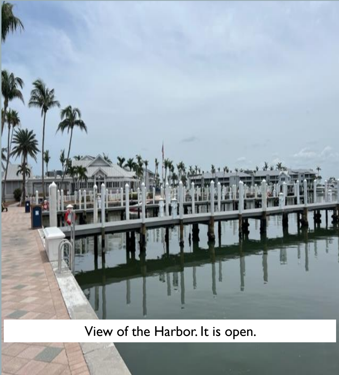
View of the Harbor. It is open.