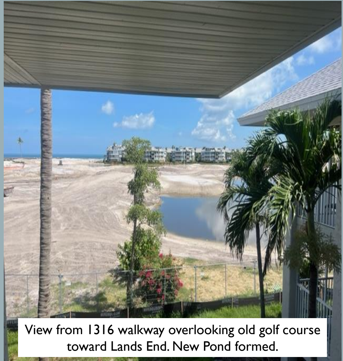
View from 1316 walkway overlooking old golf course toward Lands End. New Pond formed.