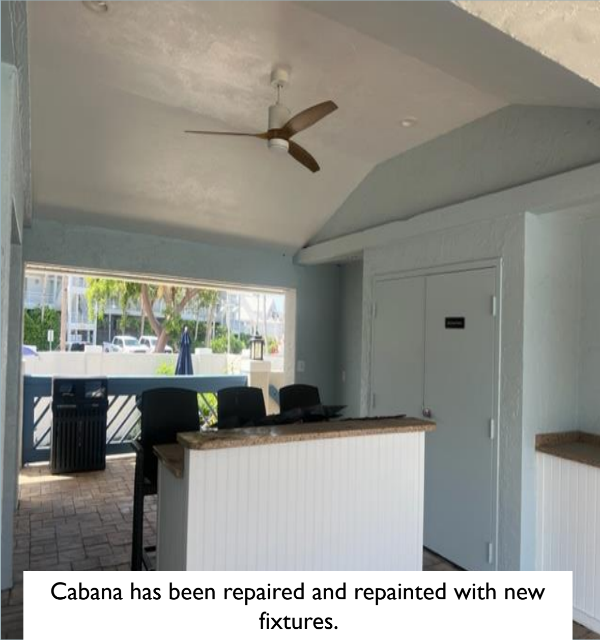
Cabana has been repaired and repainted with new fixtures.