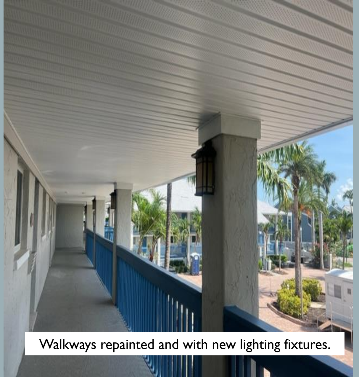
Walkways repainted and with new lighting fixtures.