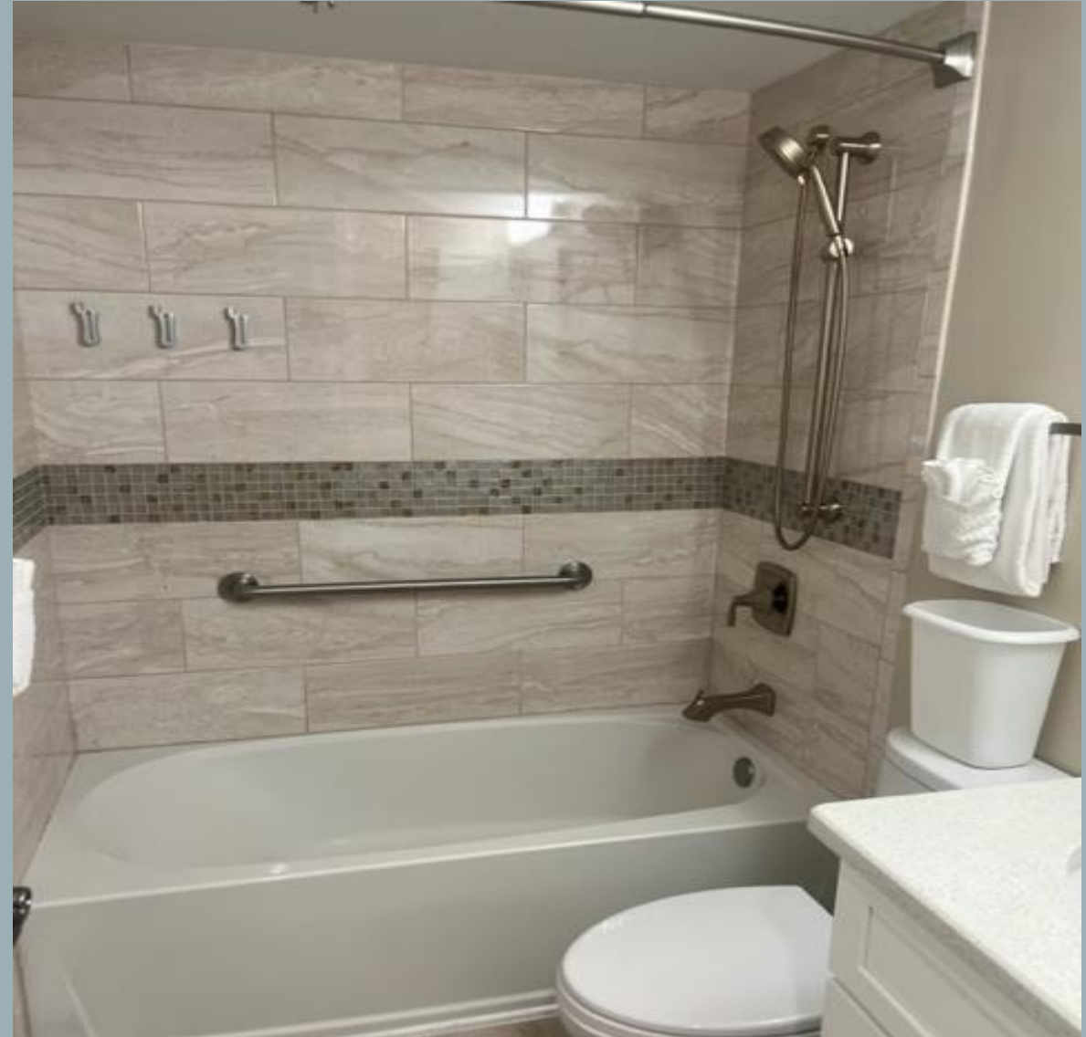
Guest Bathrooms have been repaired and inspected. New Shampoo, Conditioner and Body Wash dispensers are installed in the Shower to reduce small individual bottle waste.