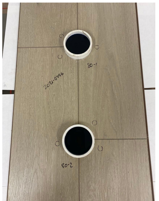
Figure 35: 80-Hour T-Seam at four-hour mark