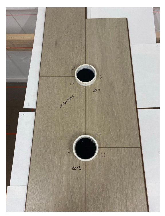
Figure 40: 80-Hour T-Seam at 72-hour mark