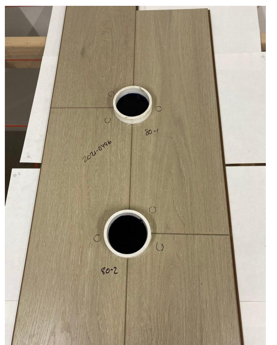
Figure 39: 80-Hour T-Seam at 48-hour mark