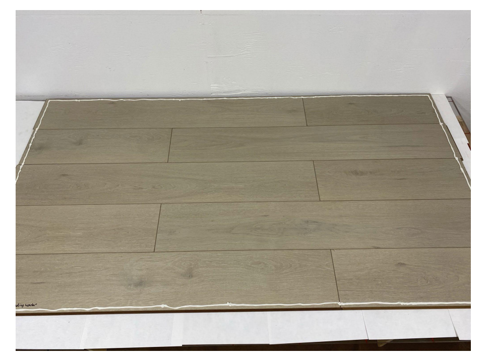
Figure 1: 30-Hour Standing Water Test Assembly prior to addition of water

Page 10 of 24 BMI Report #: 0721510-132 BMI Laboratory ID #: 2021-0496 BMI Test Report Date: 4/30/2021 Date Last Revised: Not Applicable