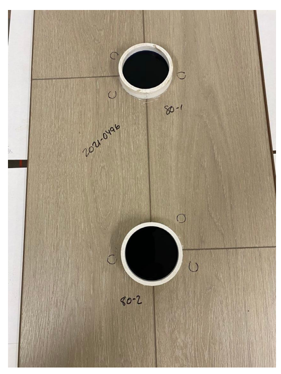
Figure 32: 80-Hour T-Seam at 30-minute mark