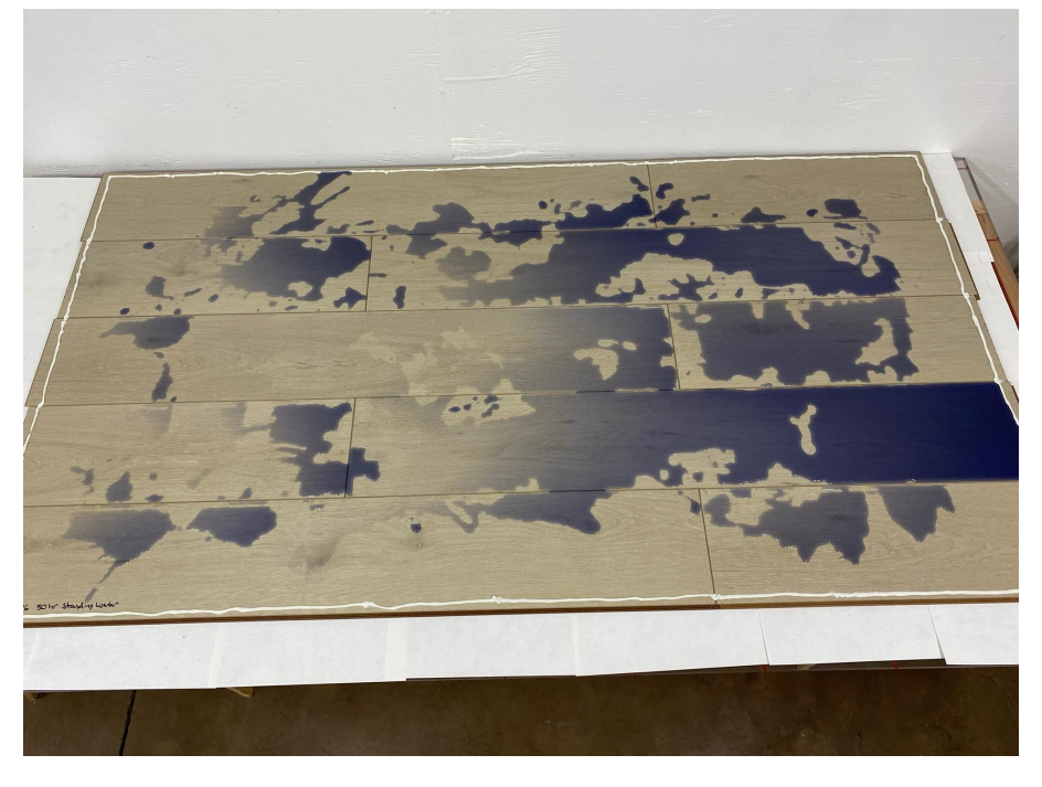
Figure 3: 30-Hour Standing Water Test Assembly at the 30-minute mark

Page 11 of 24 BMI Report #: 0721510-132 BMI Laboratory ID #: 2021-0496 BMI Test Report Date: 4/30/2021 Date Last Revised: Not Applicable