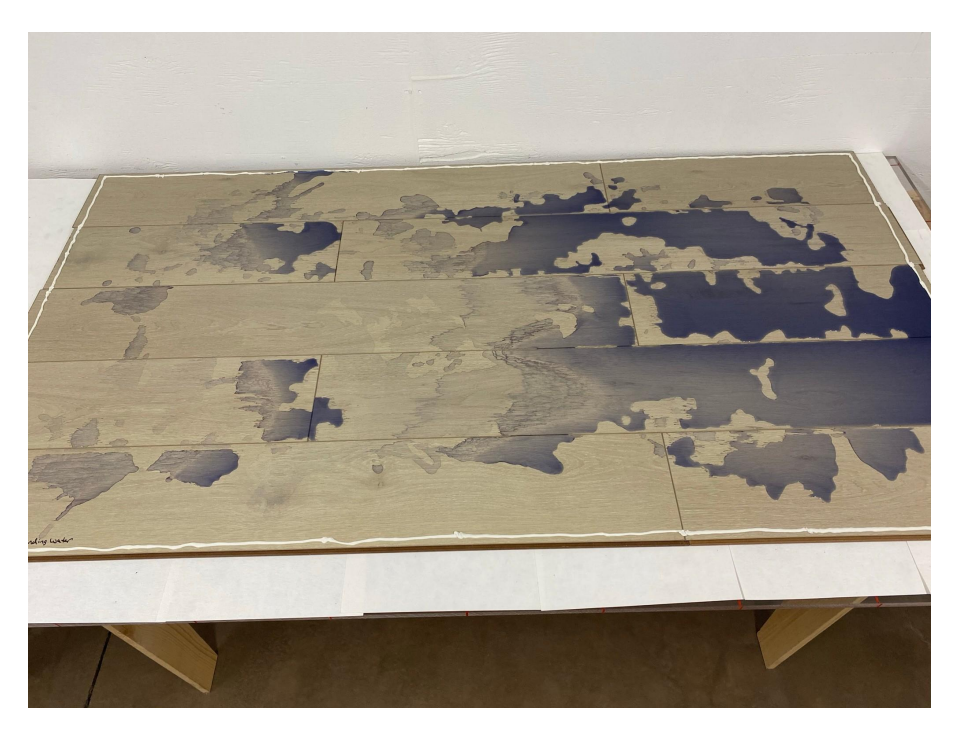
Figure 8: 30-Hour Standing Water Test Assembly at the eight-hour mark