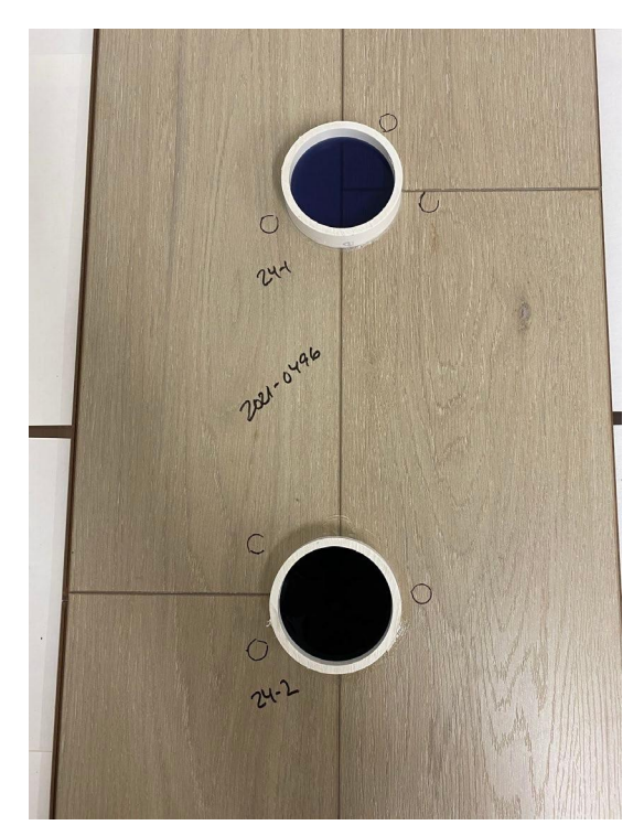
Figure 13: 24-Hour T-Seam at 30-minute mark