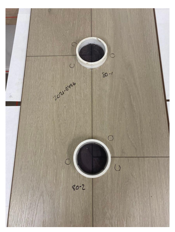
Figure 41: 80-Hour T-Seam at 80-hour mark

Page 22 of 24 BMI Report #: 0721510-132 BMI Laboratory ID #: 2021-0496 BMI Test Report Date: 4/30/2021 Date Last Revised: Not Applicable