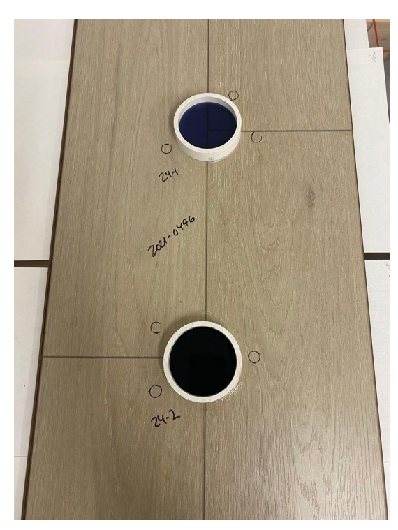
Figure 16: 24-Hour T-Seam at four-hour mark