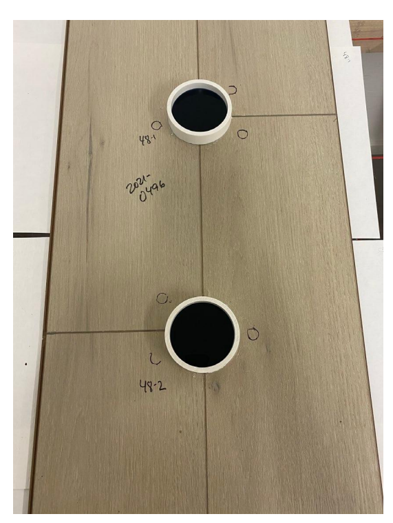
Figure 24: 48-Hour T-Seam at two-hour mark