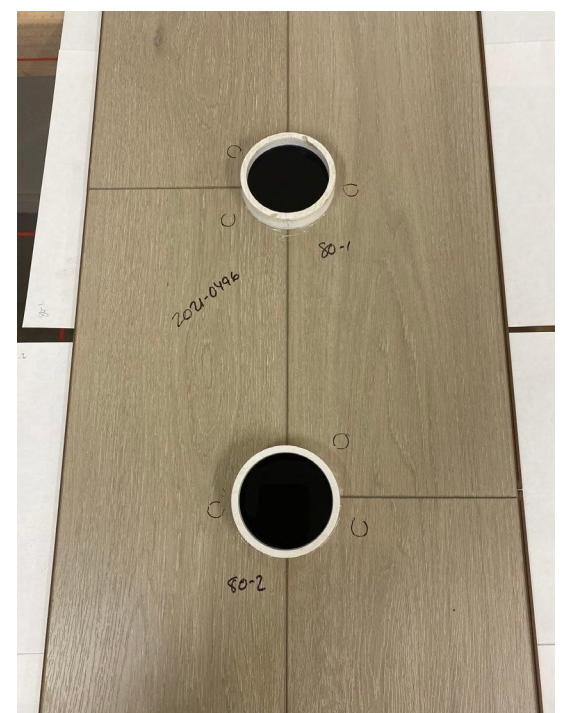
Figure 31: 80-Hour T-Seam at commencement of test