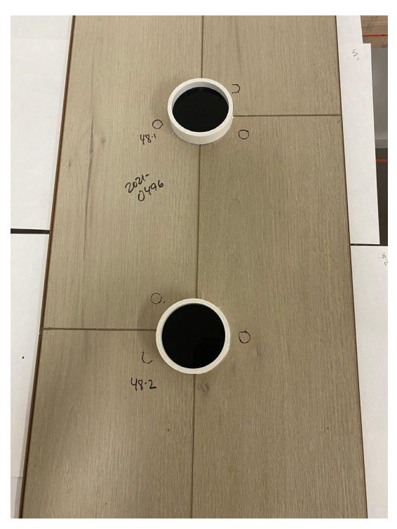
Figure 21: 48-Hour T-Seam at commencement of test