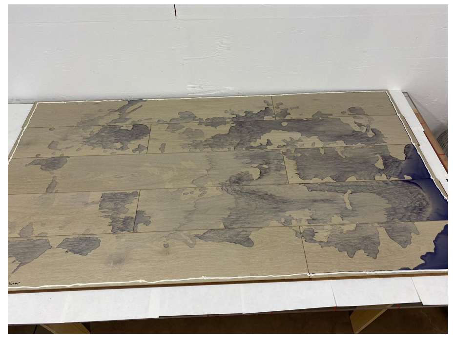
Figure 9: 30-Hour Standing Water Test Assembly at the 24-hour mark

Page 14 of 24 BMI Report #: 0721510-132 BMI Laboratory ID #: 2021-0496 BMI Test Report Date: 4/30/2021 Date Last Revised: Not Applicable