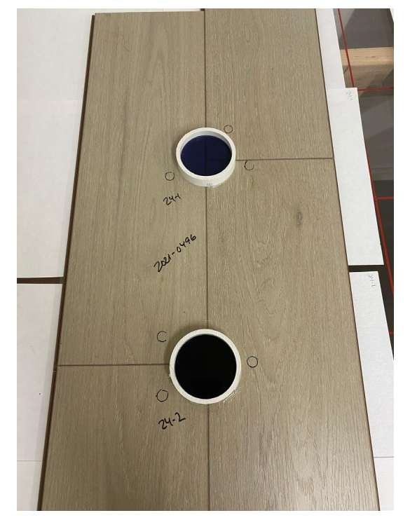
Figure 12: 24-Hour T-Seam at commencement of test