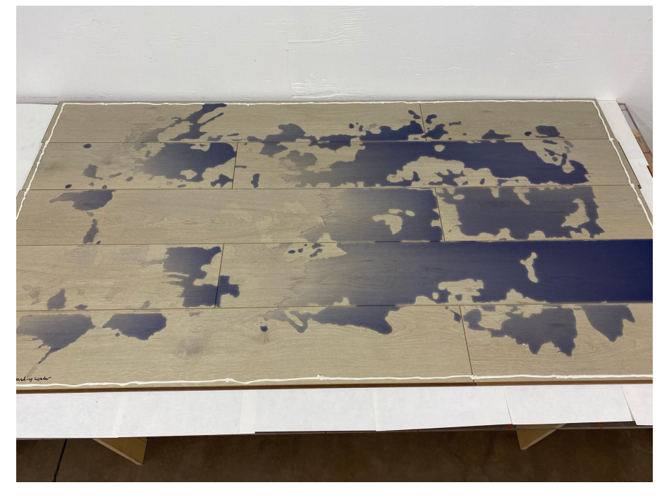
Figure 5: 30-Hour Standing Water Test Assembly at the two-hour mark

Page 12 of 24 BMI Report #: 0721510-132 BMI Laboratory ID #: 2021-0496 BMI Test Report Date: 4/30/2021 Date Last Revised: Not Applicable