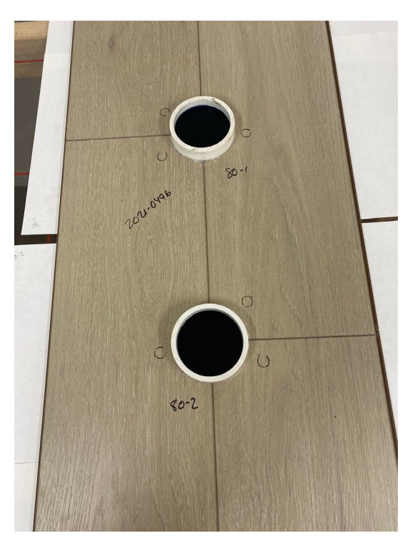
Figure 37: 80-Hour T-Seam at eight-hour mark

Page 21 of 24 BMI Report #: 0721510-132 BMI Laboratory ID #: 2021-0496 BMI Test Report Date: 4/30/2021 Date Last Revised: Not Applicable