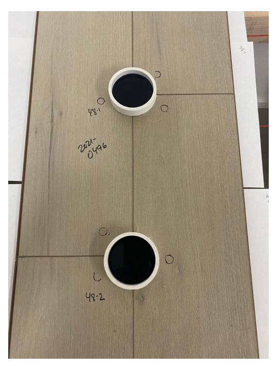
Figure 25: 48-Hour T-Seam at four-hour mark

Page 18 of 24 BMI Report #: 0721510-132 BMI Laboratory ID #: 2021-0496 BMI Test Report Date: 4/30/2021 Date Last Revised: Not Applicable