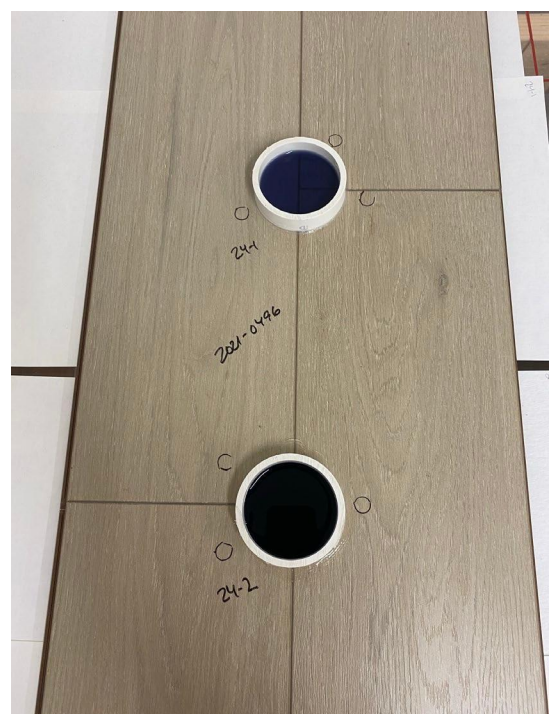
Figure 15: 24-Hour T-Seam at two-hour mark