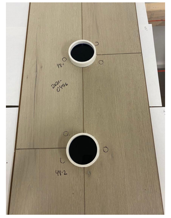
Figure 27: 48-Hour T-Seam at eight-hour mark