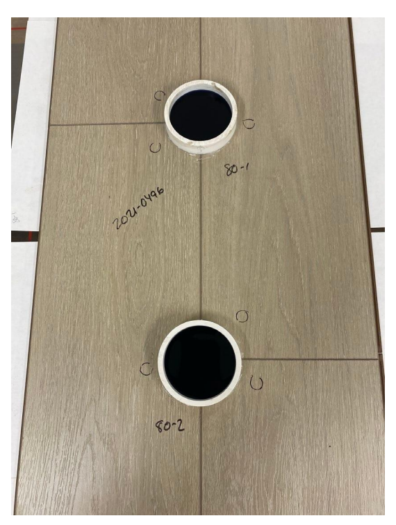
Figure 33: 80-Hour T-Seam at one-hour mark

Page 20 of 24 BMI Report #: 0721510-132 BMI Laboratory ID #: 2021-0496 BMI Test Report Date: 4/30/2021 Date Last Revised: Not Applicable