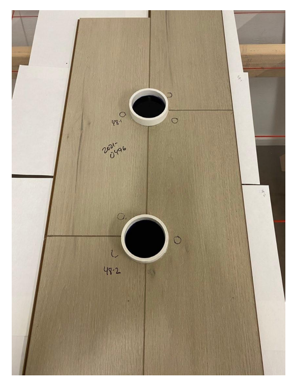
Figure 29: 48-Hour T-Seam at 48-hour mark

Page 19 of 24 BMI Report #: 0721510-132 BMI Laboratory ID #: 2021-0496 BMI Test Report Date: 4/30/2021 Date Last Revised: Not Applicable