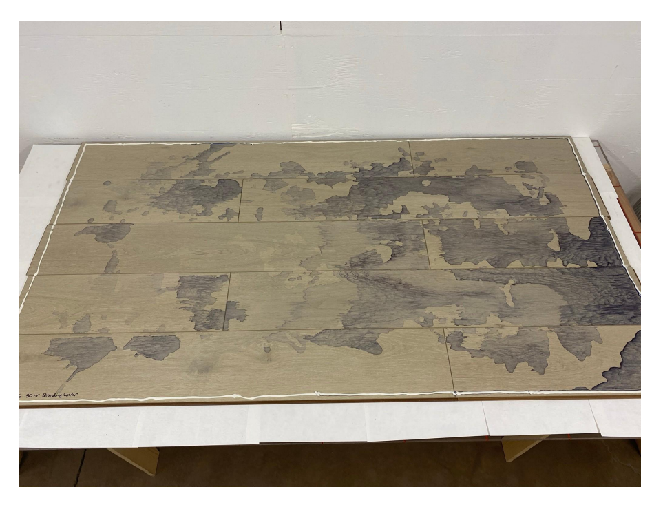
Figure 10: 30-Hour Standing Water Assembly at the 30-hour mark