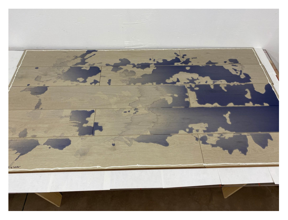
Figure 6: 30-Hour Standing Water Test Assembly at the four-hour mark