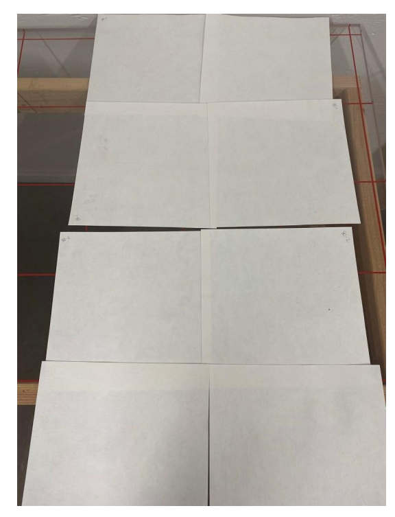
Figure 42: Blotter papers, 80-Hour T-Seam, at endpoint

Page 23 of 24 BMI Report #: 0721510-132 BMI Laboratory ID #: 2021-0496 BMI Test Report Date: 4/30/2021 Date Last Revised: Not Applicable