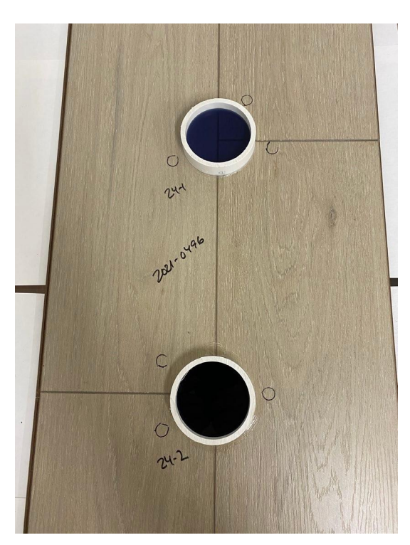
Figure 17: 24-Hour T-Seam at six-hour mark

Page 16 of 24 BMI Report #: 0721510-132 BMI Laboratory ID #: 2021-0496 BMI Test Report Date: 4/30/2021 Date Last Revised: Not Applicable