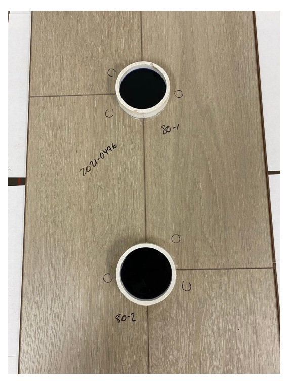
Figure 36: 80-Hour T-Seam at six-hour mark