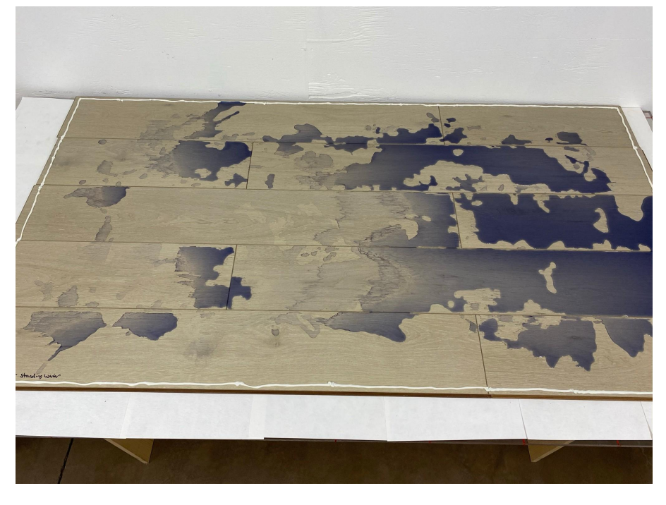
Figure 7: 30-Hour Standing Water Test Assembly at the six-hour mark

Page 13 of 24 BMI Report #: 0721510-132 BMI Laboratory ID #: 2021-0496 BMI Test Report Date: 4/30/2021 Date Last Revised: Not Applicable