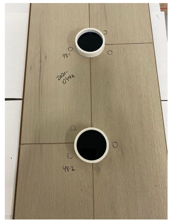
Figure 23: 48-Hour T-Seam at one-hour mark