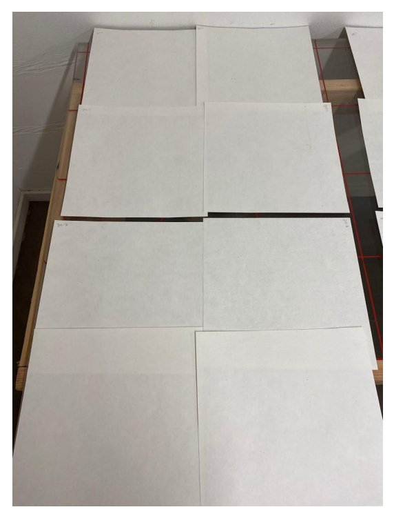
Figure 20: Blotter papers, 24-Hour T-Seam, at endpoint