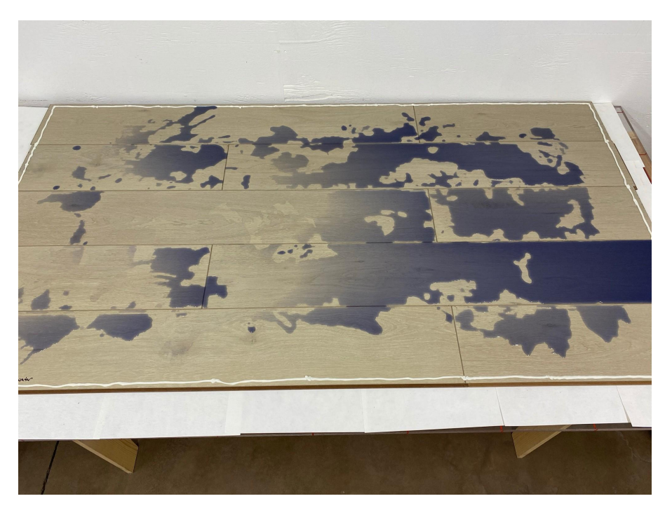
Figure 4: 30-Hour Standing Water Test Assembly at the one-hour mark