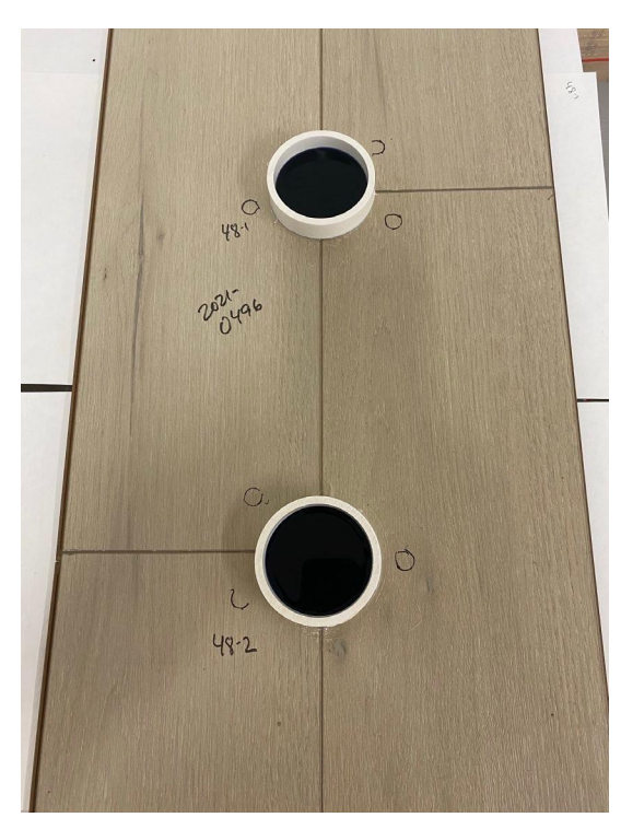
Figure 28: 48-Hour T-Seam at 24-hour mark