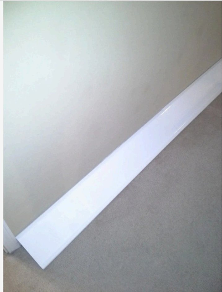
Baseboard Paint Shield (2 per pack)